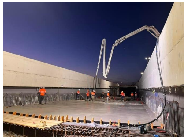
Concrete pour at the southern dive

Both dive structures are progressing well with piling works to be completed at the northern dive this month. Once the piling works are complete, the team will begin excavating the dirt from the structure. You will also start to see the limestone retaining wall being built between Guildford Road to Collier Road, the first step in the rebuild of the Tonkin Highway's northbound carriageway.