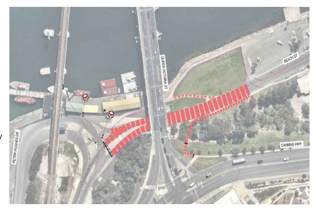
Figure 1 – Road closure location