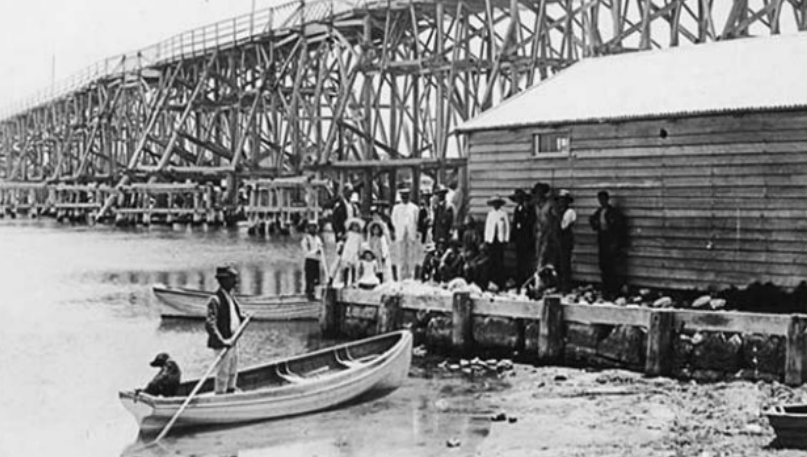
High Level Bridge 1866: the first Fremantle bridge was built out of timber by convict labour 1863-7, and was officially opened 2 October 1867. (Hitchock: 52)