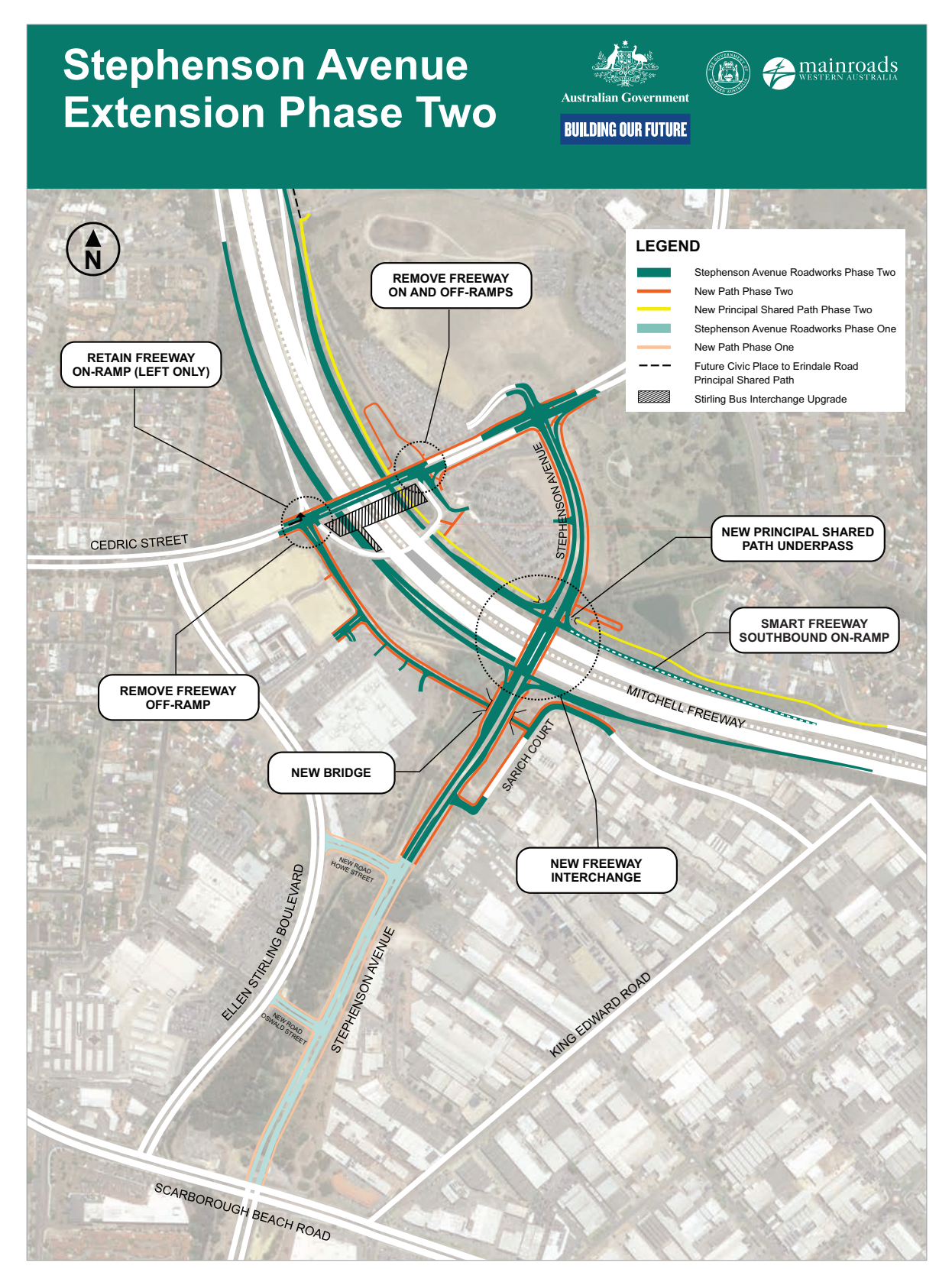
Stephenson Avenue Extension Project Phase One and Two map is available on the Main Roads website.