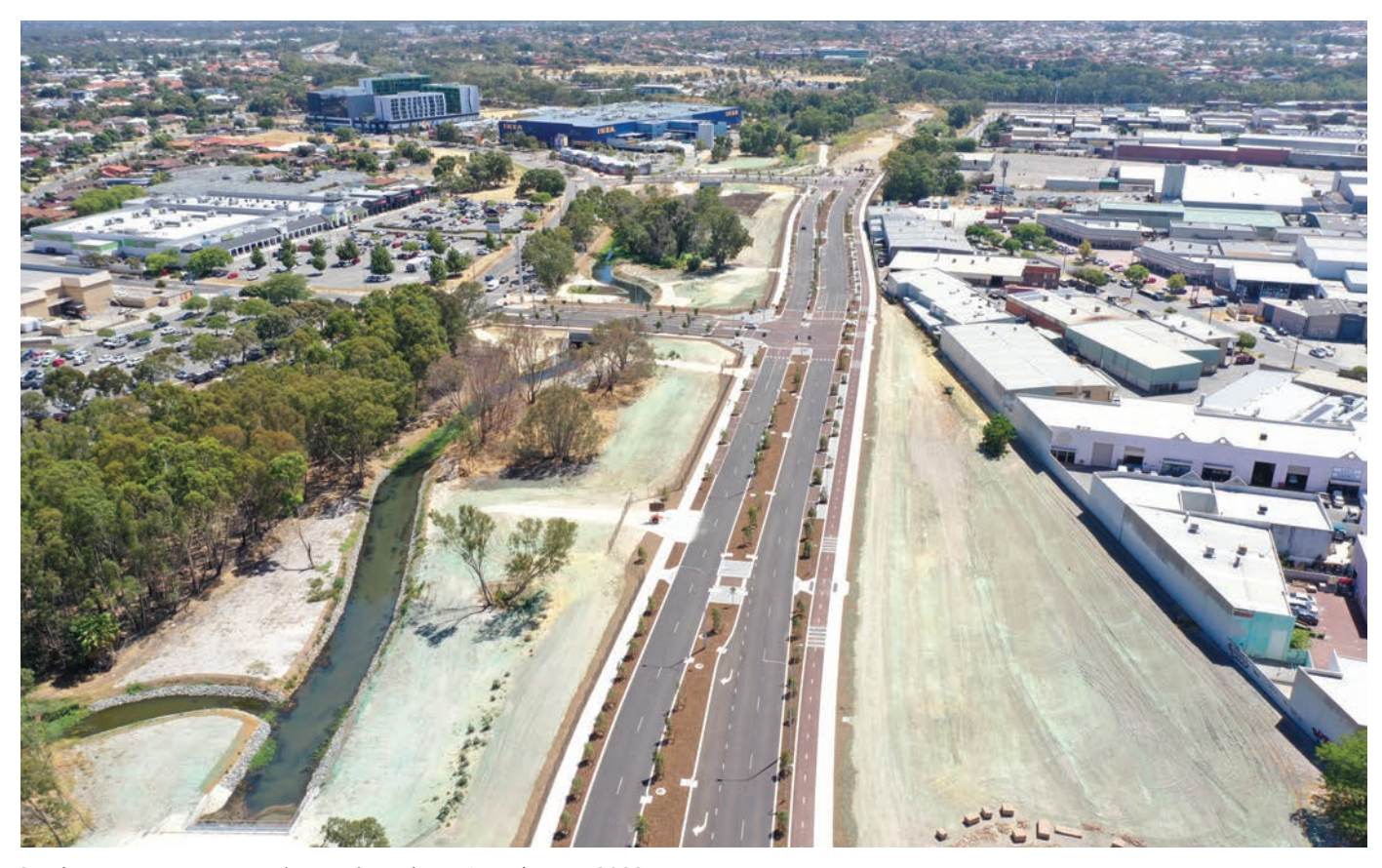
Stephenson Avenue Extension Project Phase 1 - February 2022

Main Roads has appointed the S2M Evolution Alliance to design and construct the Stephenson Avenue Extension Phase Two. The alliance comprises Acciona, Clough and WSP.