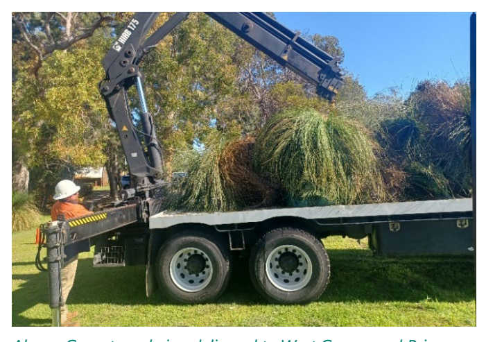
Above: Grass trees being delivered to West Greenwood Primary School