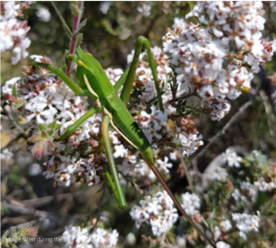
Image taken during the flora and fauna survey

We are working with the Department of Biodiversity Conservation and Attractions and the City of Wanneroo regarding these connections and will prepare information for the wider community to consider in early 2020.