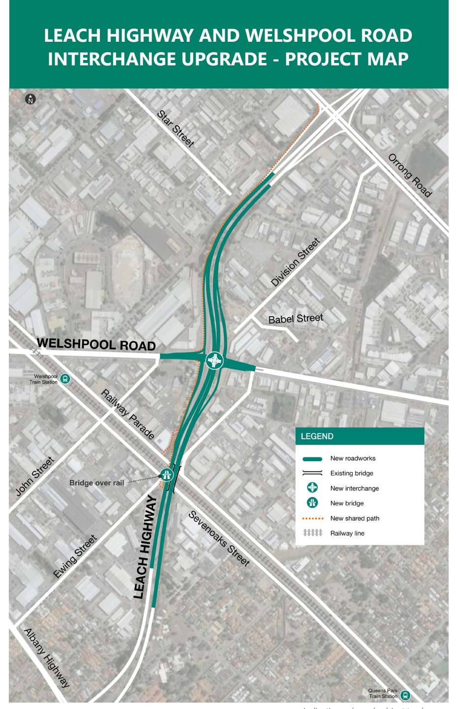
Indicative only and subject to change.

Your feedback is important and will be used to plan and deliver the project over the coming months.