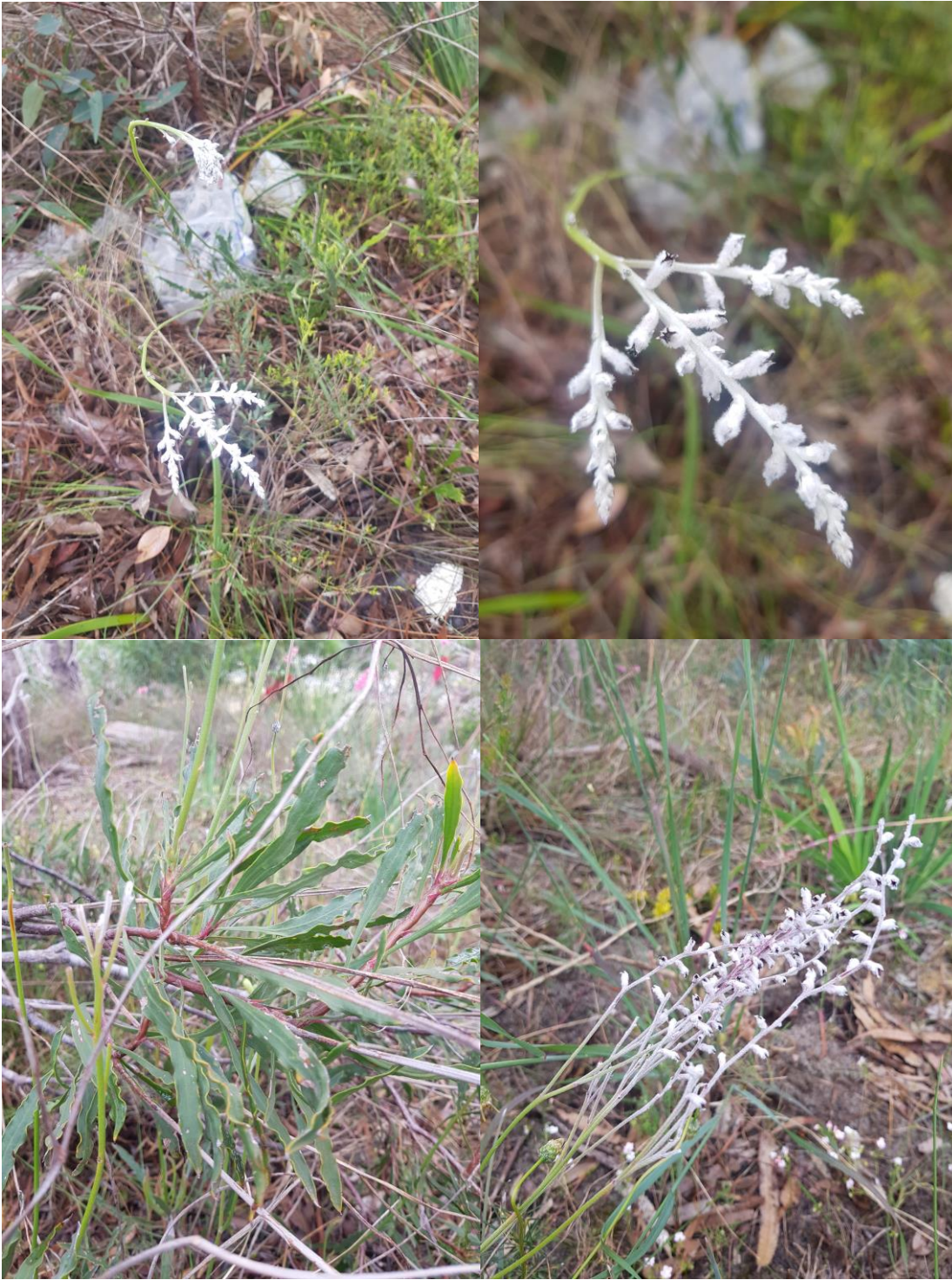
Plate 1: Conospermum undulatum in flower and distinctive leaf shape