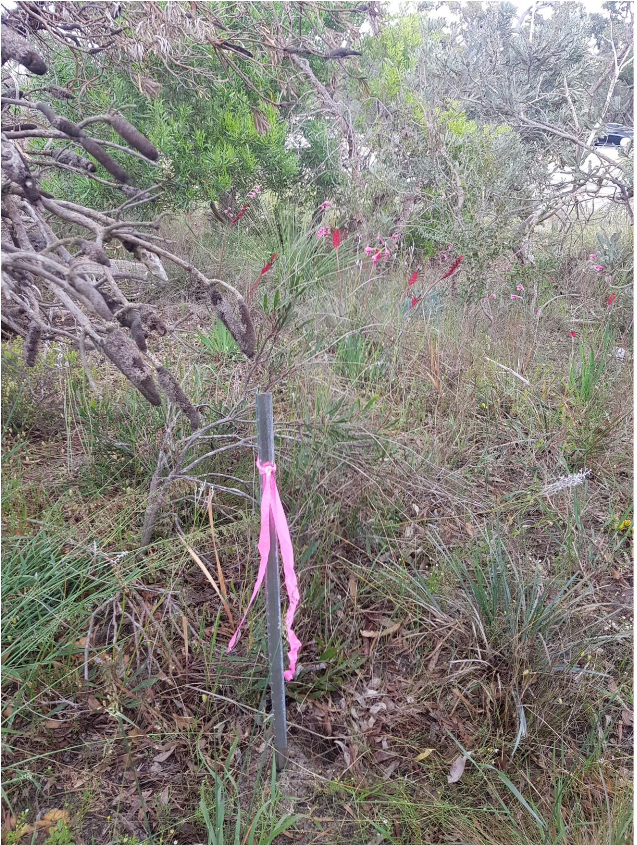
Plate 2: Demarcated individual of Conospermum undulatum