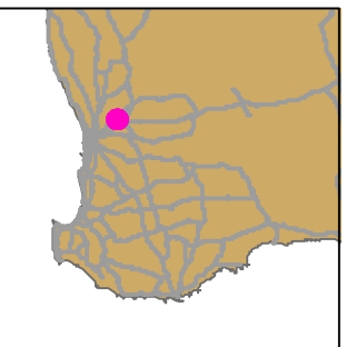
Figure 1: Clearing undertaken during Reporting Period