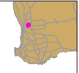
Figure 1a: Clearing undertaken for Toodyay Rd Upgrade and Widening Project (EPBC 2016/7665) during Reporting Period (Jan 2020 to Jan 2021). Legend

• Trees with suitable black cockatoo nesting hollows removed during reporting period