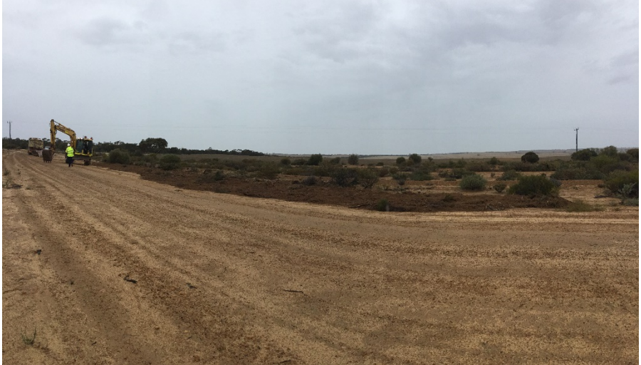
Photograph 4: Respread of topsoil to 5 cm thickness in cleared area of revegetation offset site