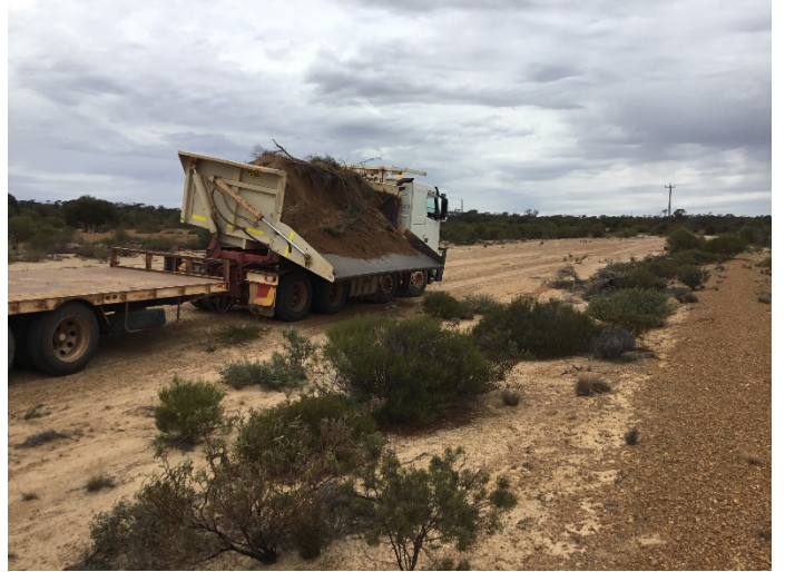
Photograph 3: Transfer of topsoil and cleared vegetative material to revegetation offset site