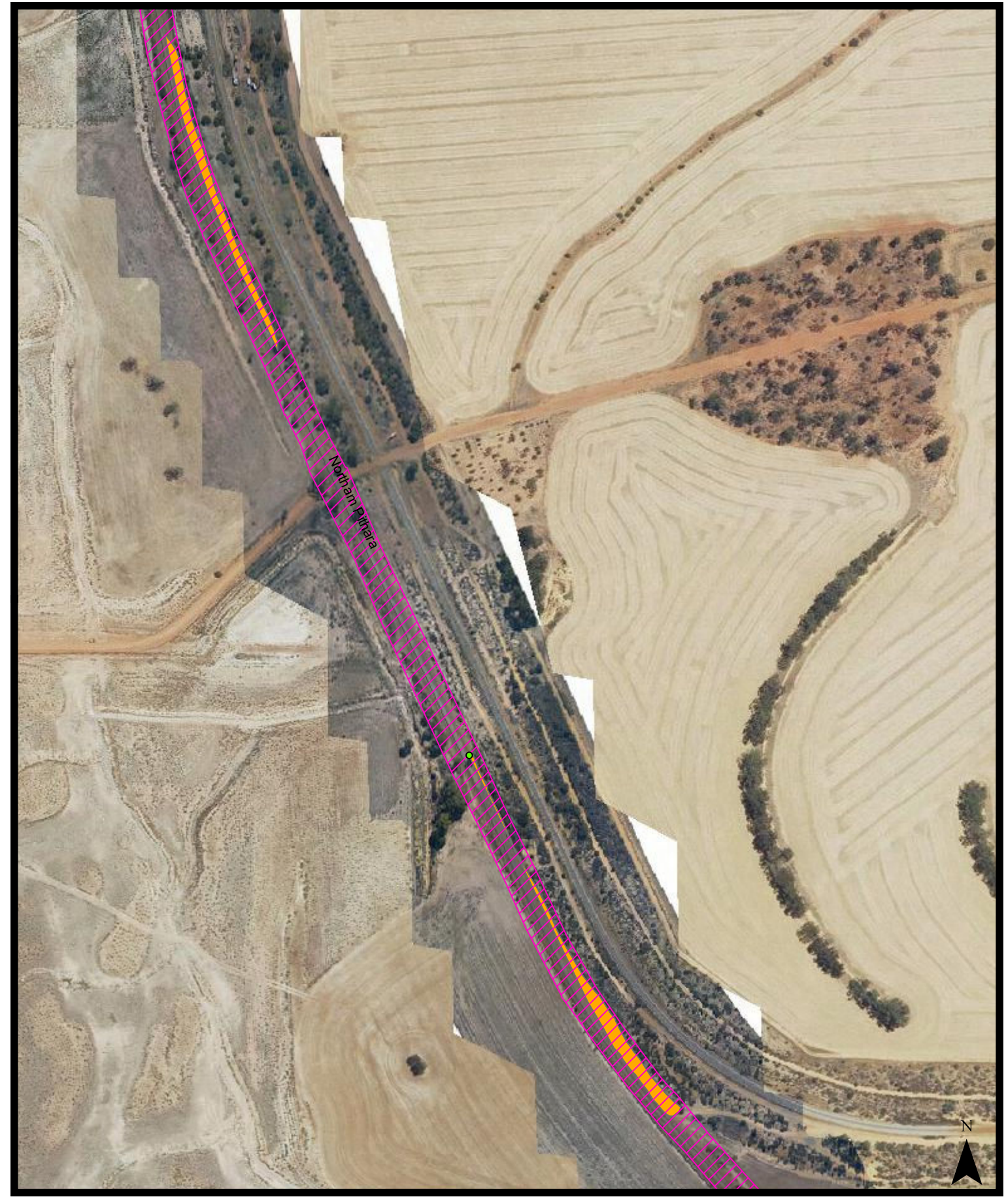
Figure 1b - Northam Pithara Rd clearing undertaken during reporting period