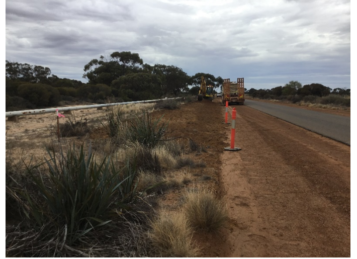
Photograph 1: Demarcation and topsoil stripping in location of Dampiera glabrescens prior to clearing