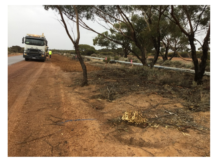
Photograph 2: Demarcation and topsoil stripping in location of Dampiera glabrescens prior to clearing