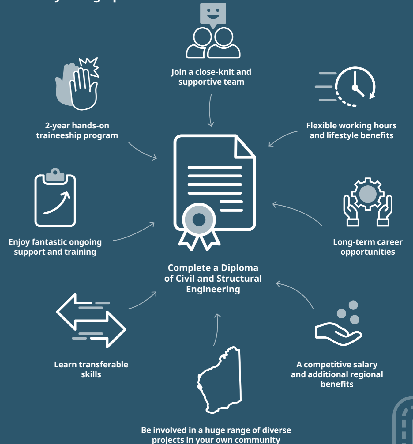
Regional Engineering Associate Traineeship Program – Main Roads