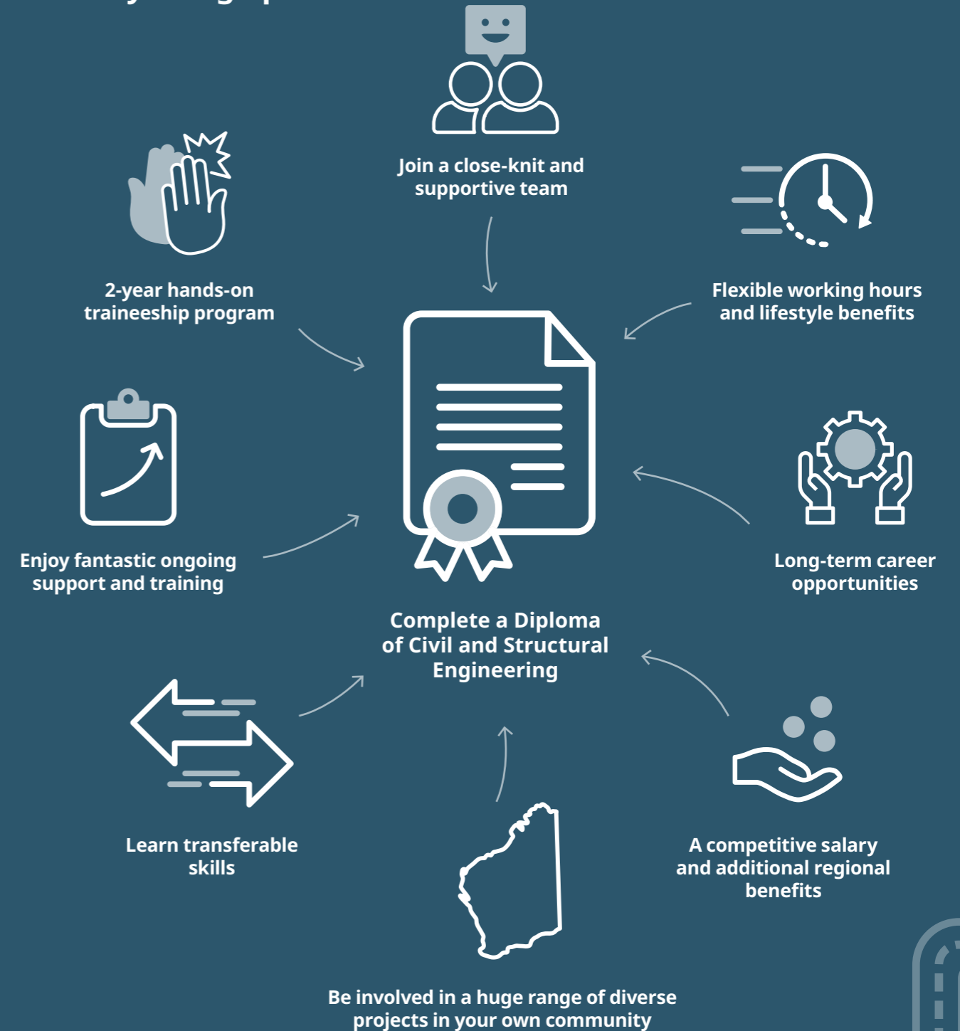
Regional Engineering Associate Traineeship Program – Main Roads