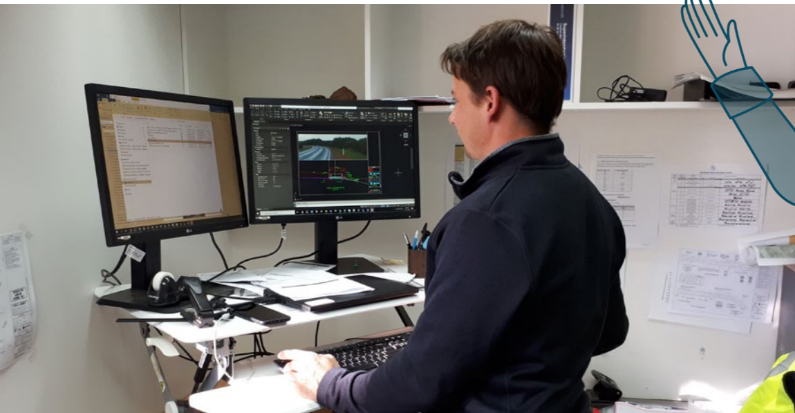
Main Roads – Regional Engineering Associate Traineeship Program