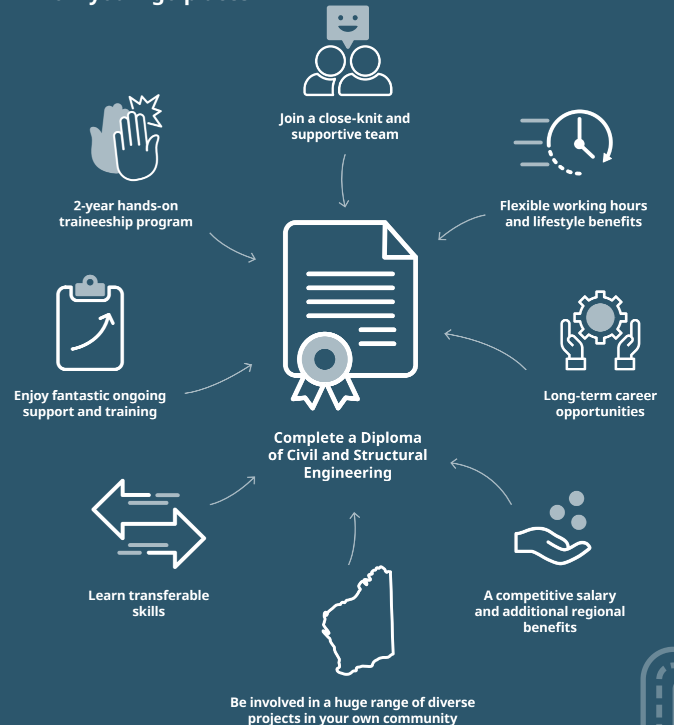
Regional Engineering Associate Traineeship Program – Main Roads