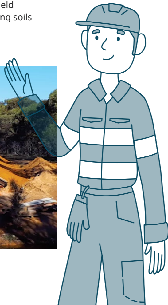
Main Roads – Regional Engineering Associate Traineeship Program