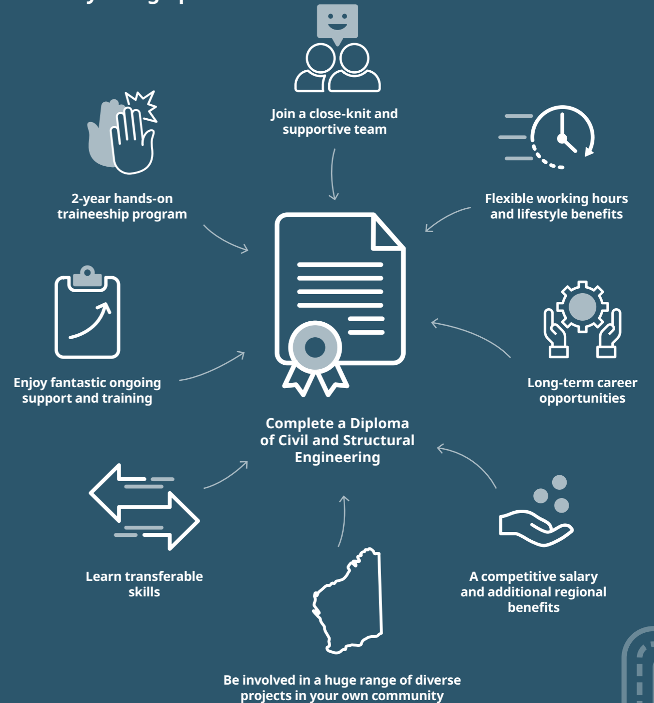
Regional Engineering Associate Traineeship Program – Main Roads