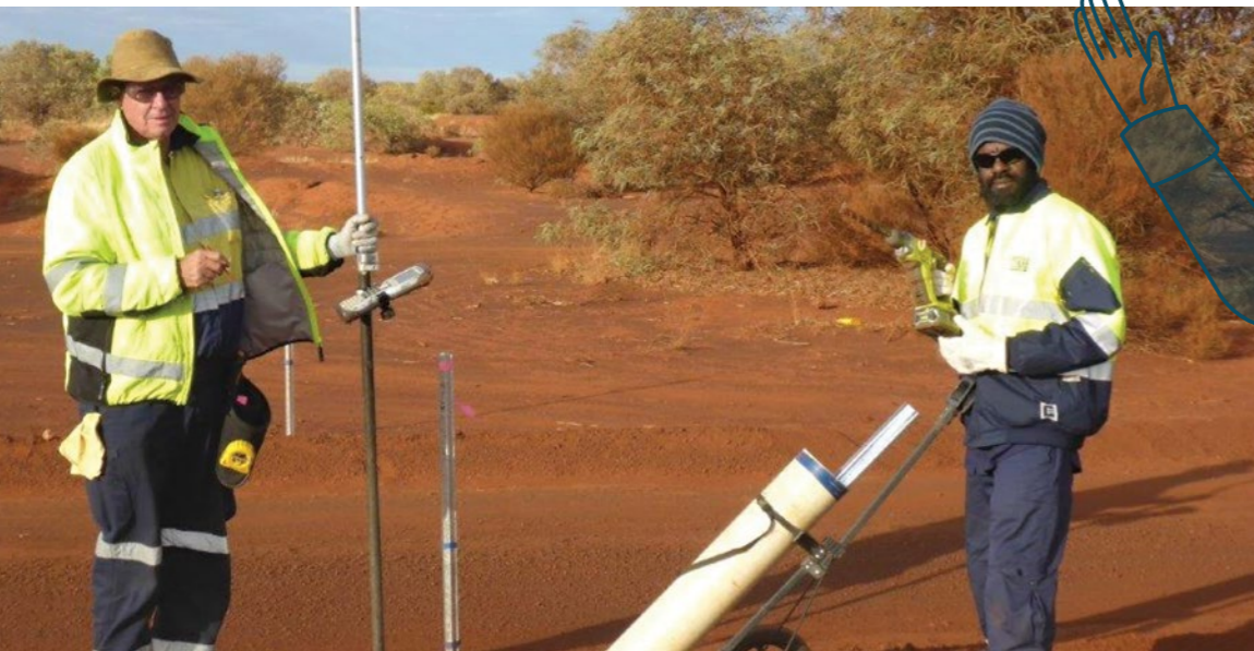
Main Roads – Regional Engineering Associate Traineeship Program