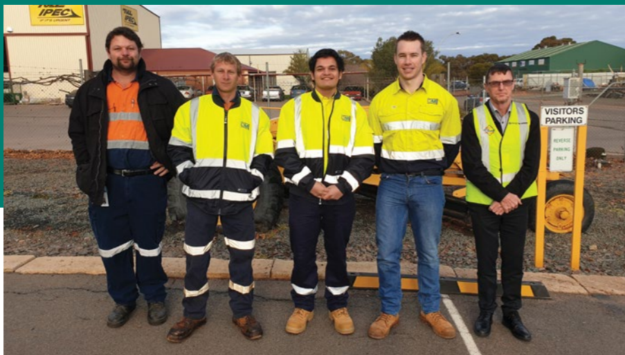
Main Roads – Regional Engineering Associate Traineeship Program