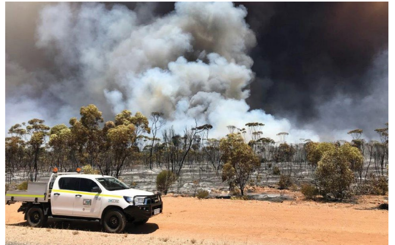
Regional Engineering Associate Traineeship Program – Main Roads

Our Regional Engineering Associate Traineeship Program will allow you to kick-start your career within the Goldfields-Esperance region. Here, you'll take on a diverse range of challenges while enjoying flexible working hours that give you more time to spend with family and friends.