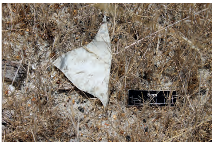
IMG_0141 .....400398 mE 6484323 mN Patterned ceramic plate fragment