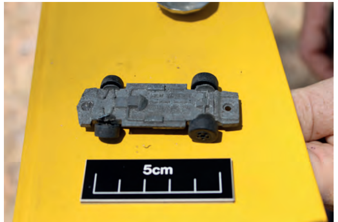
IMG_0134 .....400374 mE 6484309 mN Children's toy "Hot Wheels Car"