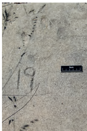
IMG_0154 .....400378 mE 6484409 mN The left hand side of the plinth, showing a handprint and '19'.