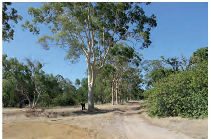
IMG_0182 .....400332 mE 6484117 mN Avenue of trees to north