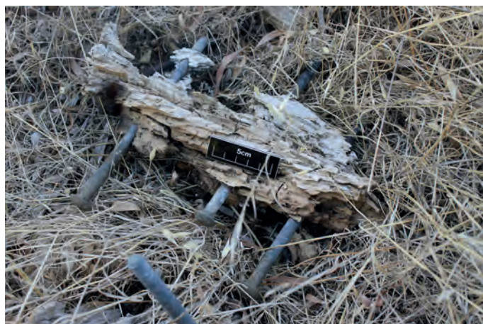
IMG_0174 .....400333 mE 6484038 mN View of large galvanised bullet head bolts.