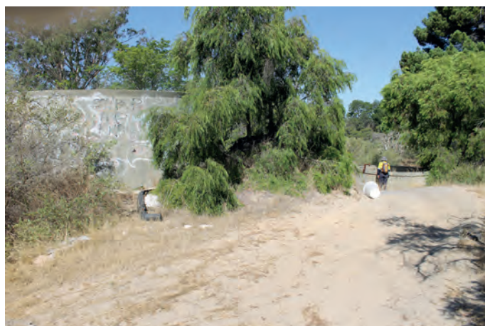
IMG_0176 .....400341 mE 6484080 mN Modern water tank