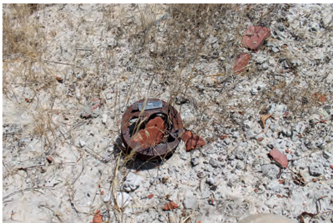
IMG_0143 .....400393 mE 6484356 mN House water drain (terracotta) and cast iron drain cover