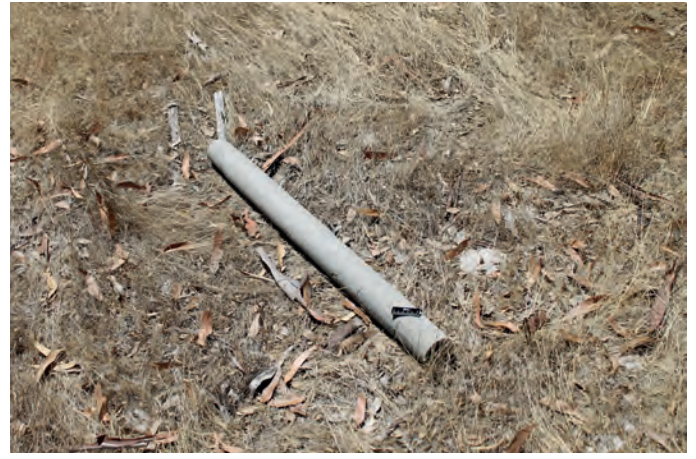
IMG_0121 .....400391 mE 6484254 mN Asbestos-lined pipe.