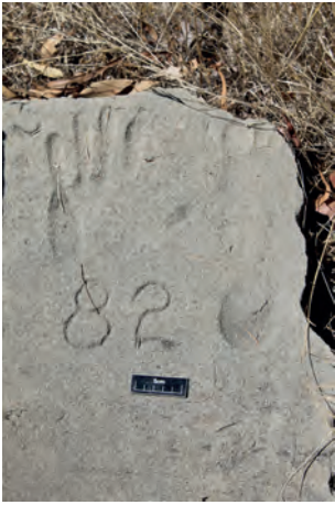
IMG_0155 .....400378 mE 6484409 mN The right hand side of the plinth, showing a hand and foot print and '82'.