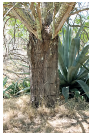
IMG_0125 .....400392 mE 6484284 mN Tree with wire wrapped around the trunk; Agave spp. also present