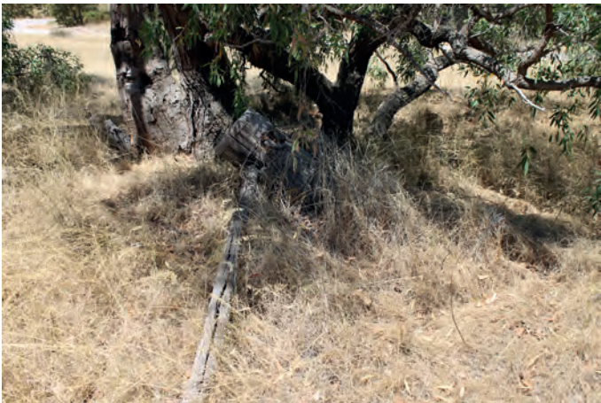
IMG_0129 .....400416 mE 6484271 mN Fallen fence post