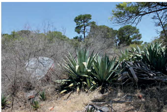
IMG_0092 .....400358 mE 6484100 mN Corrugated iron water tank within Agave spp.bushes.