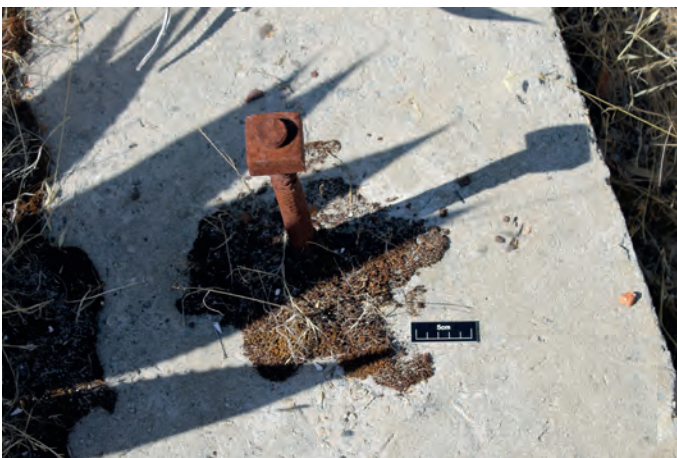
IMG_0181 .....400352 mE 6484095 mN 8 (4 x2) concrete 'feet' to support two water towers - one wooden beam at western end (may be be remanant of tower; Water tank found at Wpt 184). Lots of Agave spp. Plants