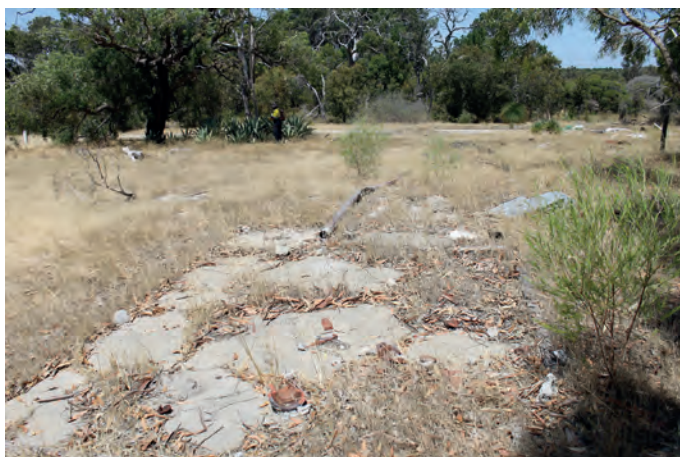
IMG_0116 .....400399 mE 6484253 mN Concrete floor/toilet slab. Wooden floor joists bolted to floor. Note terracotta pipe.