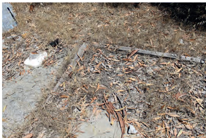
IMG_0117 .....400399 mE 6484253 mN Close view of wooden floor bearers bolted to concrete floor.