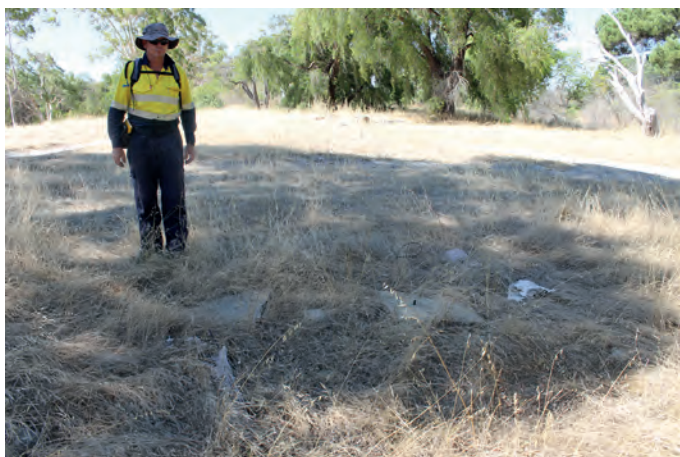
IMG_0173 .....400333 mE 6484038 mN Concrete flooring with wooden rough-hewn timbers and large galvanised bolts. Asbestos corrugated sheets