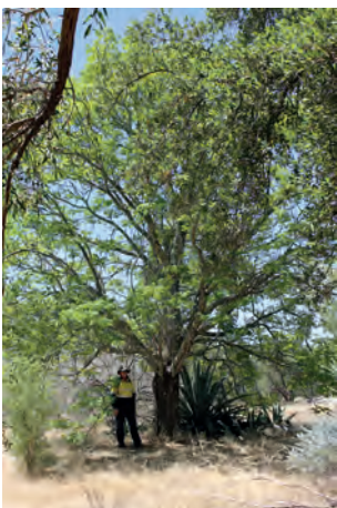
IMG_0124 .....400392 mE 6484284 mN Tree with wire wrapped around the trunk; Agave spp. also present