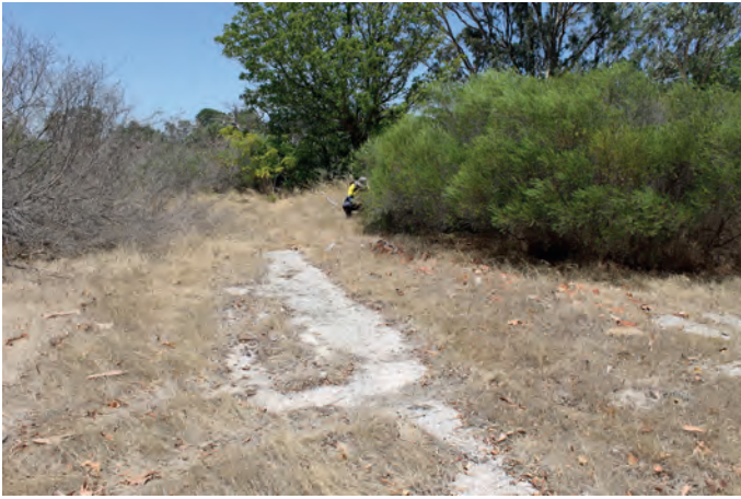
IMG_0096 .....400352 mE 6484140 mN Limestone aggregate driveway with brick rubble pile.