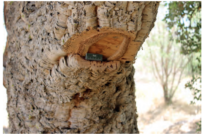
IMG_0123 .....400390 mE 6484265 mN Close view of horizontal cut made into corkwood tree.