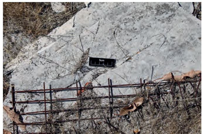
IMG_0163 .....400148 mE 6484487 mN Concrete floor with steel mesh