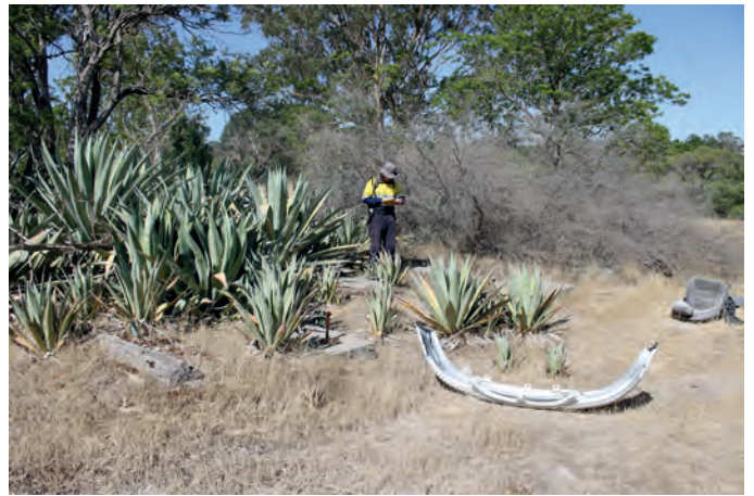
IMG_0180 .....400352 mE 6484095 mN 8 (4 x2) concrete 'feet' to support two water towers - one wooden beam at western end (may be be remanant of tower; Water tank found at Wpt 184). Lots of Agave spp. Plants