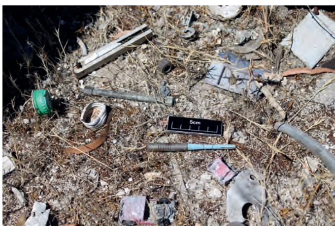
IMG_0147 .....400382 mE 6484347 mN Collected items including pipe fragments, ant caps, ceramics, bottle tops, broken darts, broken toys etc.