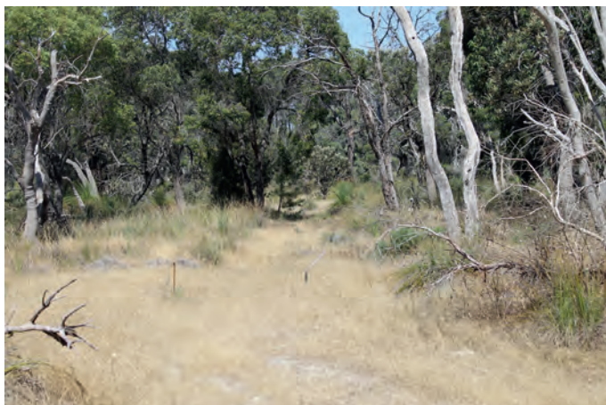
IMG_0164 .....400148 mE 6484487 mN View east along old track