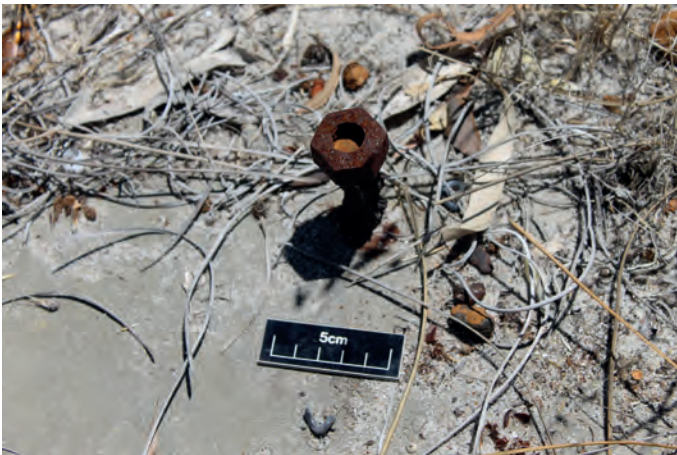
IMG_0109 .....400387 mE 6484197 mN Steel bolt/stud for fixing wooden wall bearers.