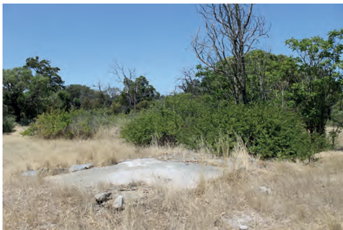
IMG_0114 .....400397 mE 6484222 mN Concrete Floor 3m x 5m next to open septic tanks with gal- vanised iron sheets on top