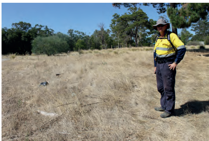
IMG_0169 .....400263 mE 6484021 mN Concrete foundation or wall