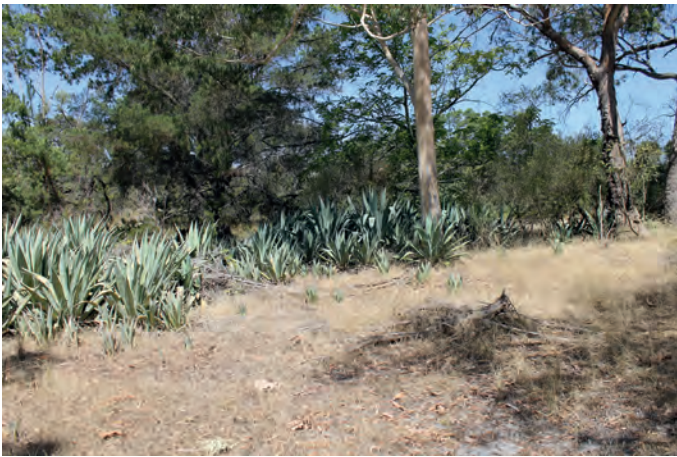
IMG_0160 .....400410 mE 6484430 mN Agave spp. Patch