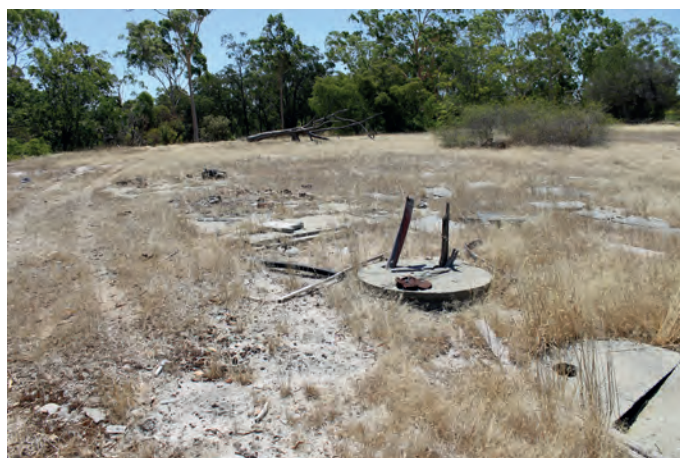
IMG_0142 .....400398 mE 6484323 mN Concrete floor 8 m x 3m . Asbestos sheets and two septic tanks.