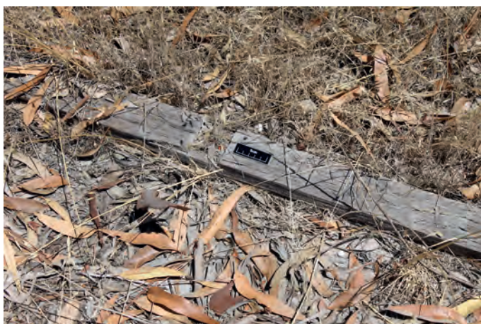
IMG_0118 .....400399 mE 6484253 mN Close view of wooden joist with trenching for wooden verti- cal studs.