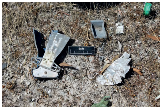
IMG_0146 .....400382 mE 6484347 mN Collected items including pipe fragments, ant caps, ceramics, bottle tops, broken darts, broken toys etc.