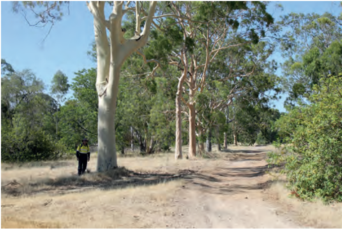
IMG_0183 .....400332 mE 6484117 mN Avenue of trees to north