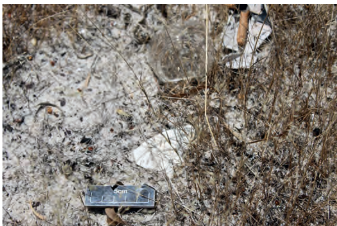
IMG_0139 .....400398 mE 6484323 mN Ceramic Egg-cup