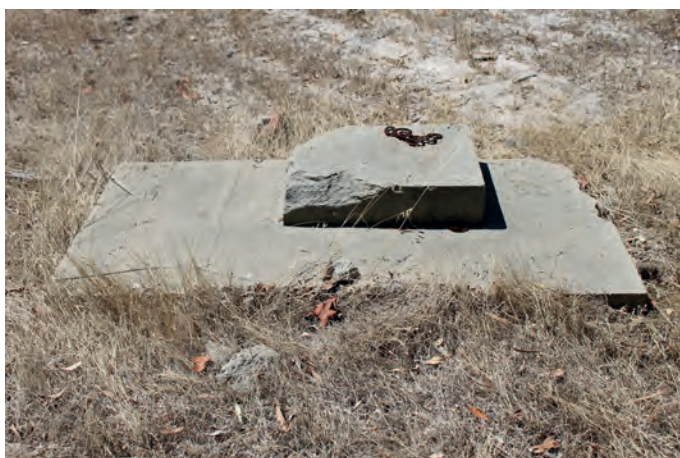
IMG_0153 .....400378 mE 6484409 mN A concrete plinth from 1982 with two handmarks marking the period.