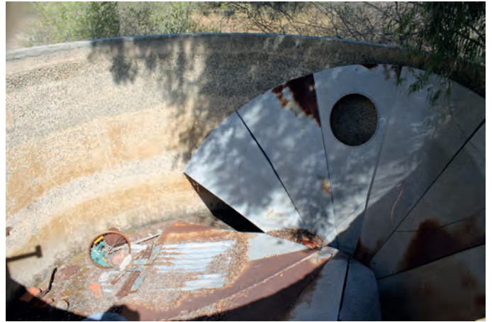
IMG_0178 .....400356 mE 6484076 mN Modern water tank (internal)