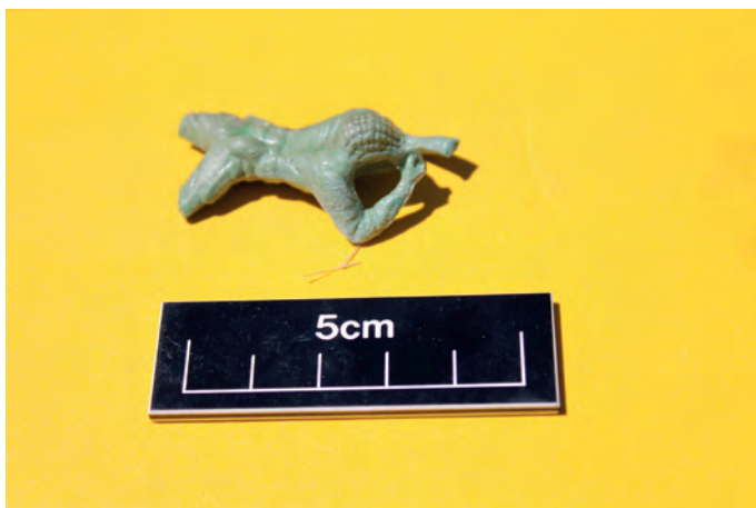
IMG_0151 .....400382 mE 6484347 mN Broken plastic toy sniper