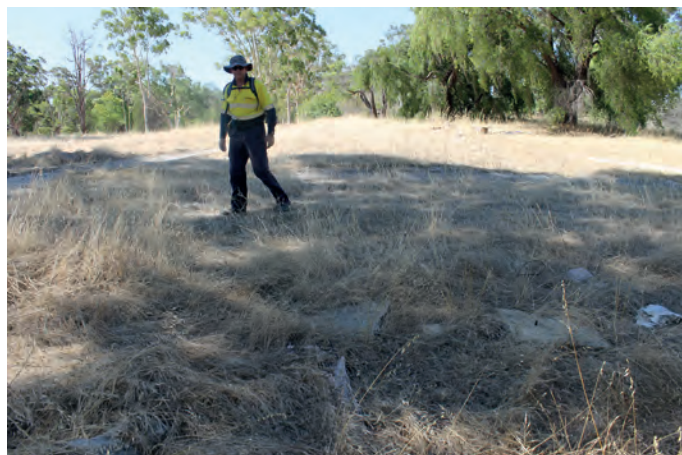
IMG_0172 .....400333 mE 6484038 mN Concrete flooring with wooden rough-hewn timbers and large galvanised bolts. Asbestos corrugated sheets