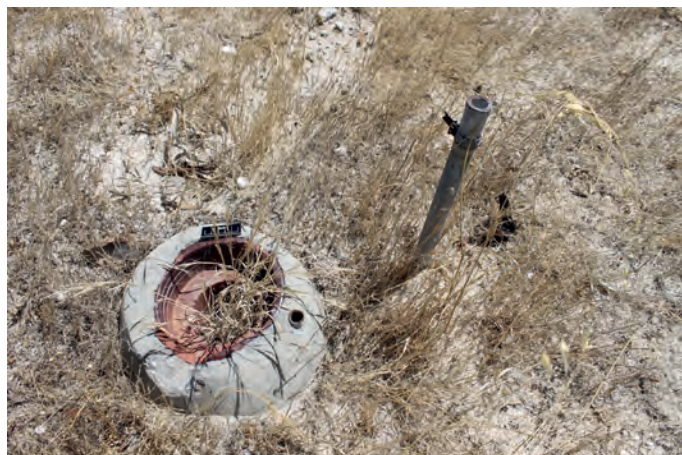
IMG_0144 .....400393 mE 6484356 mN House water drain (terracotta) with galvanised steel pipe.