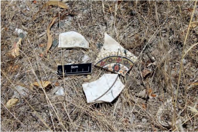
IMG_0098 .....400361 mE 6484132 mN Three pieces of patterned earthenware