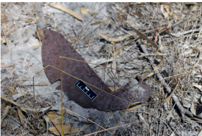
IMG_0111 .....400387 mE 6484214 mN Cast Iron Stove Top