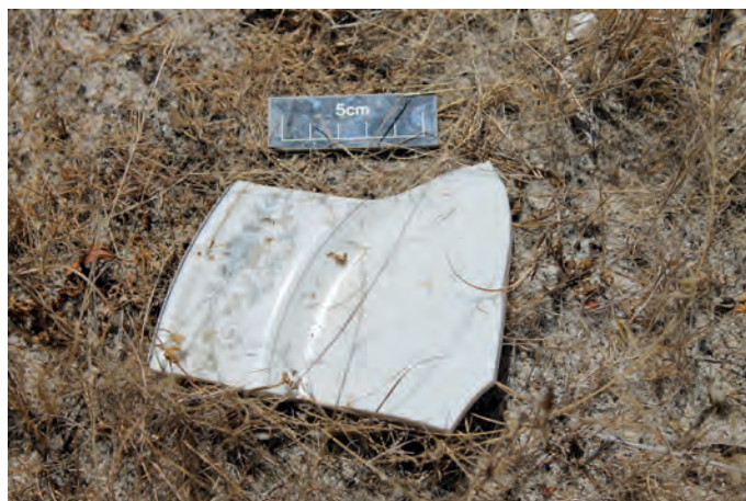
IMG_0140 .....400398 mE 6484323 mN Broken ceramic fragment and glassware.