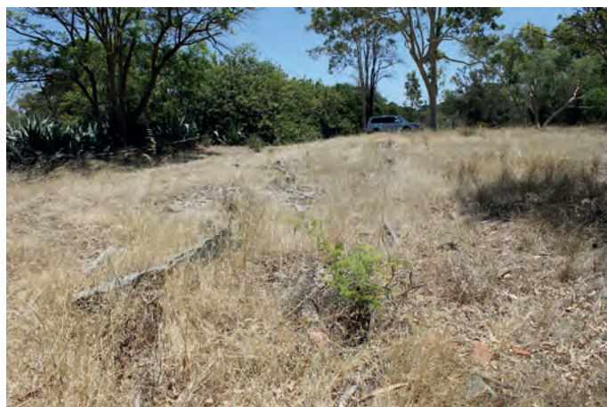
IMG_0093 .....400365 mE 6484108 mN Broken asbestos fence. Looking southwest.