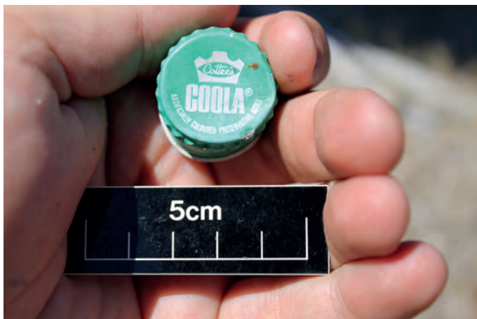
IMG_0149 .....400382 mE 6484347 mN Close view of Cottee's Coola bottle cap