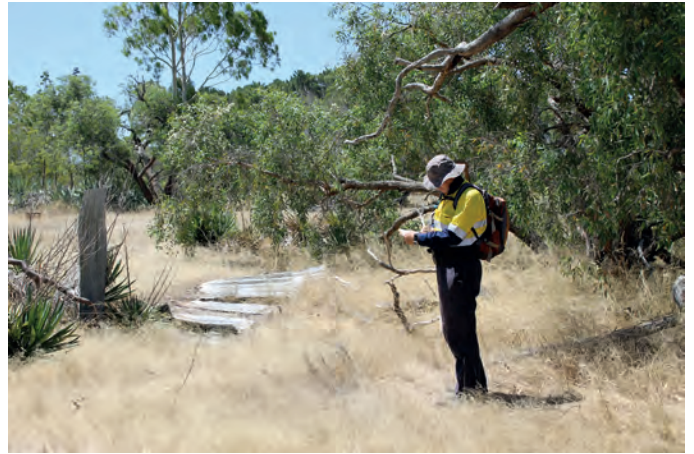
IMG_0128 .....400408 mE 6484273 mN Fallen corrugated iron fence; Agave plants