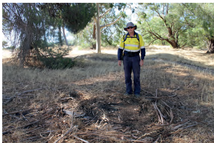
IMG_0170 .....400351 mE 6483998 mN Small wooden structure: wooden base and skirts with floors of jarrah timber sleepers.