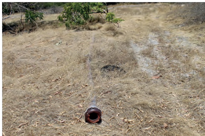
IMG_0091 .....400364 mE 6484099 mN Long buried terracotta pipe.