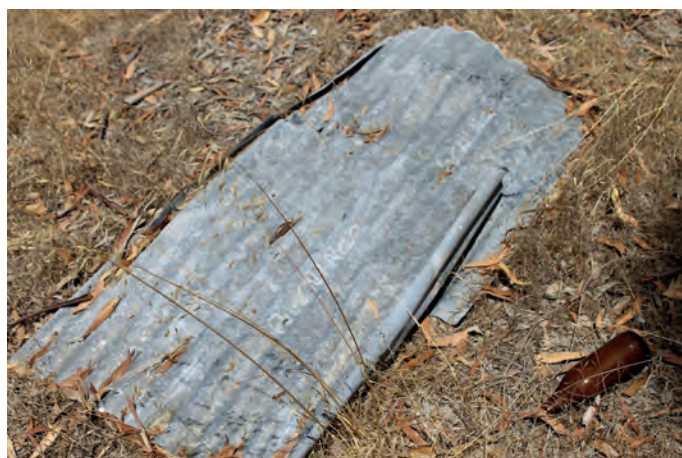
IMG_0119 .....400399 mE 6484253 mN Bunnings' handscrawled on sheets.