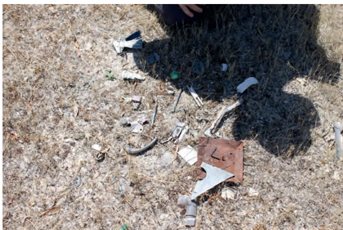
IMG_0145 .....400382 mE 6484347 mN Collected items including pipe fragments, ant caps, ceramics, bottle tops, broken darts, broken toys etc.