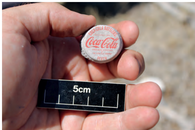
IMG_0150 .....400382 mE 6484347 mN Close view of Coca Cola bottle cap