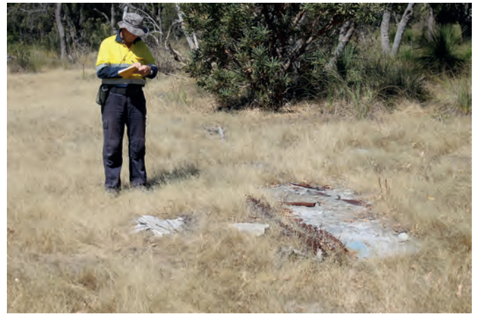
IMG_0161 .....400148 mE 6484487 mN Dump of asbestos, wire, miniorb roll of tin; old fencing wire; Located on graded area & old track leading NE off main rack