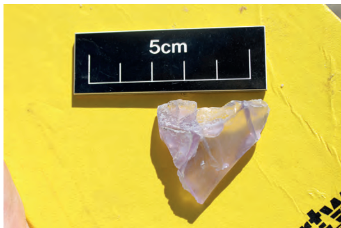
IMG_0167 .....400244 mE 6484123 mN Light purple glassware