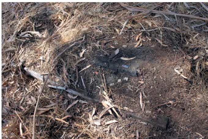
IMG_0171 .....400351 mE 6483998 mN Small wooden structure: wooden base and skirts with floors of jarrah timber sleepers. Close view