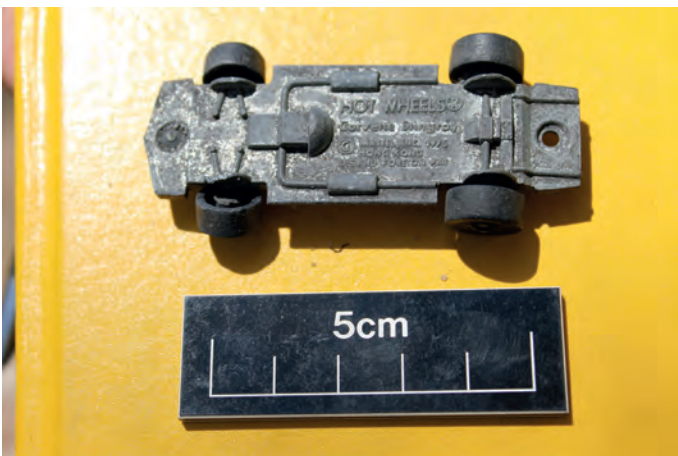
IMG_0135 .....400374 mE 6484309 mN Children's toy "Hot Wheels Car"