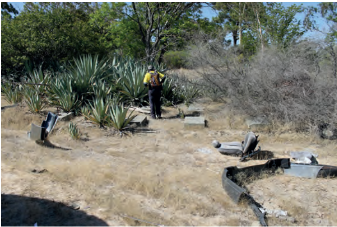
IMG_0179 .....400352 mE 6484095 mN Close view of large steel bolts within concrete foundations.