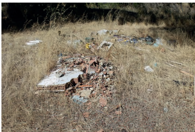
IMG_0175 .....400338 mE 6484058 mN Modern rubbish dump.