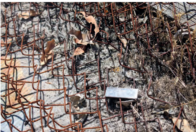
IMG_0162 .....400148 mE 6484487 mN Close view of old-style chicken wire.