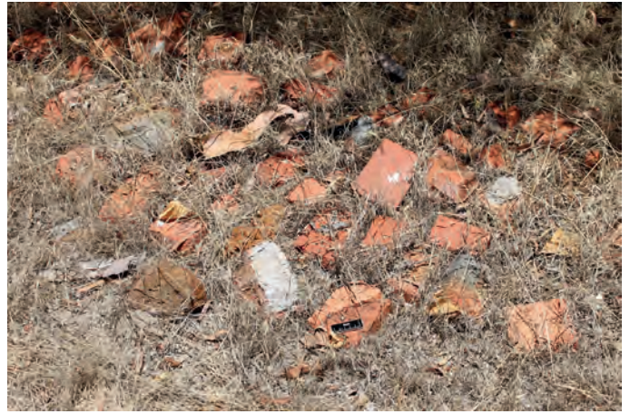
IMG_0097 .....400352 mE 6484140 mN Close view of clay brick rubble