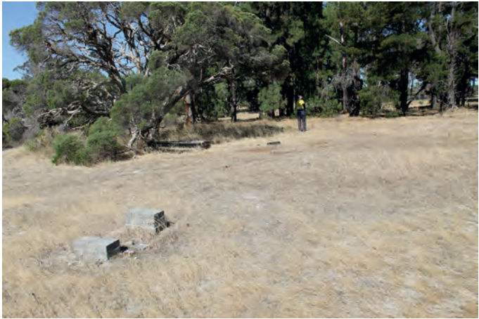
IMG_0184 .....400415 mE 6483960 mN Brick plinth or footing wih non-insitu brickwork