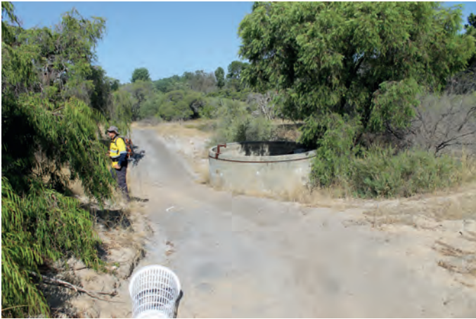
IMG_0177 .....400356 mE 6484076 mN Modern water tank