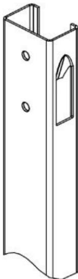
Isometric View of Post & Washer NTS