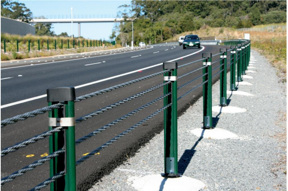
Photograph of installed Flexfence TL4 Wire Rope Safety Barrier