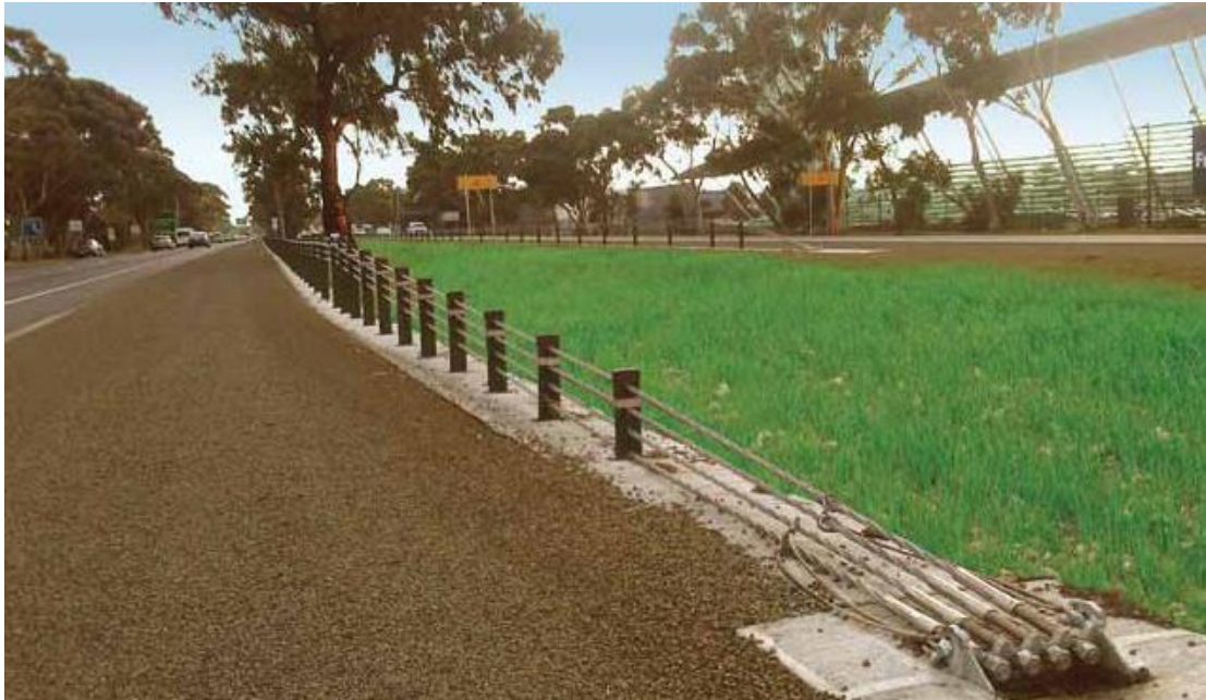
Photograph of installed Flexfence TL3 Terminal (foreground)