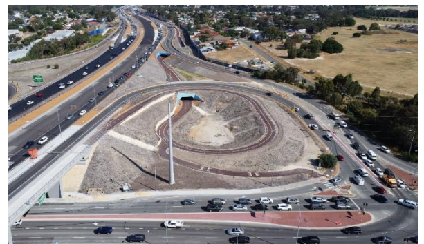
PSP between Dunstone Road and Guildford Road

We plan to have the shared path adjacent to River Road open later this month. Once open, this will connect path users to Claughton