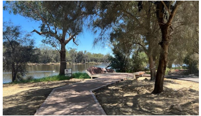
Interpretation node and seating

We have now completed and opened an interpretation node near the bridge on the Belmont side which forms part of the Department of Biodiversity and Attractions River Journeys program . For this node, we conducted heritage surveys, and two sites of Aboriginal cultural significance were identified within the works area. This includes the Derbarl Yerrigan (Swan River) and two River Gum trees each with a single cultural scar. The signage acknowledges both the scar trees and the Derbarl Yerrigan. Make sure you pause to take a read next time you are in the area.