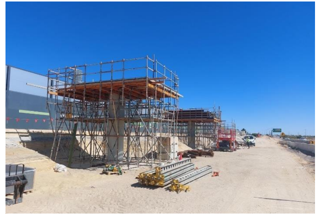
Malaga footbridge works