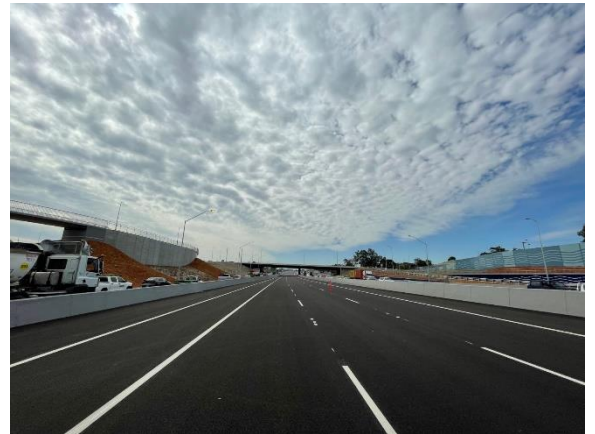
Final asphalt and permanent line marking

Once all finishing works are complete the speed will increase to 100km/h. Reminder - as works will continue for METRONET Morley-Ellenbrook Line the 80km/h will remain in place on Tonkin Highway between Collier Road and Hepburn Avenue until mid-2024.