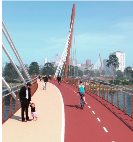
Figure 1: Concept image of the segregated path on Boorloo Bridge

For more information, see our Path Users Fact Sheet .