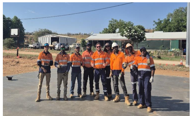
Above: Trainee team conducting works in the community.

Under supervision, the trainees managed the pre-planning and all project works including formwork, concreting and installation of equipment, creating a much-loved community asset.