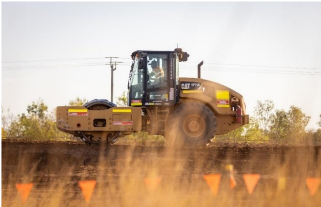
Above: Local roller operator working on Great Northern Highway.

In total, more than $14 million has been spent across 43 Kimberley businesses, 25 of which are Aboriginal owned.