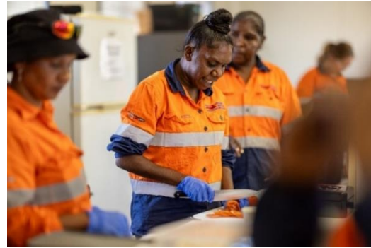
Above: Hospitality trainees working in the site canteen.

The project prioritises comprehensive on-site support for local workers, especially those new to the workforce. Fitzroy Valley-based organisation Gurama Yani U, together with the Fitzroy Bridge Alliance, supports workers to remove barriers that could hinder participation in the workforce. This support includes providing access to accommodation, reliable transport, meals, PPE and on-site pastoral care and mentoring.