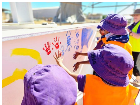
Bayulu school kids visit site

For further information, please call 138 138, email enquiries@mainroads.wa.gov.au or visit https://www.mainroads.wa.gov.au/new-brooking-channel-bridge