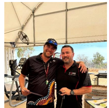
Security trainee graduation event

Recently, eight local Fitzroy Bridge Alliance security employees, working with Core Security on-site, completed their security training. The course included training in duty of care, self-defence, security patrols, first aid and property protection. Course participants are now able to obtain roles as Security Officers or Community Wardens.