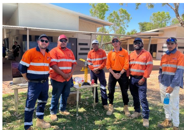
FBA team at Skutta Bloke Day