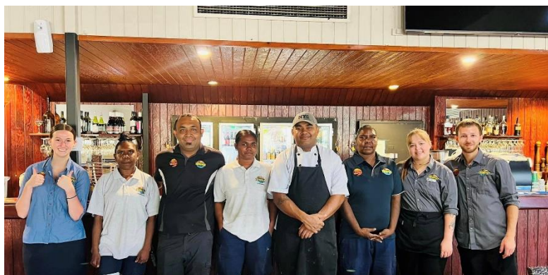
Work placements at a local hospitality venue.

As part of the project, several local workers are completing a Certificate III in Hospitality. The workers currently provide important kitchen, housekeeping and site maintenance support to the project.