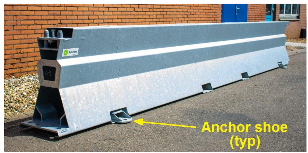
Photograph of 5.8m long element (2# anchor shoes shown)