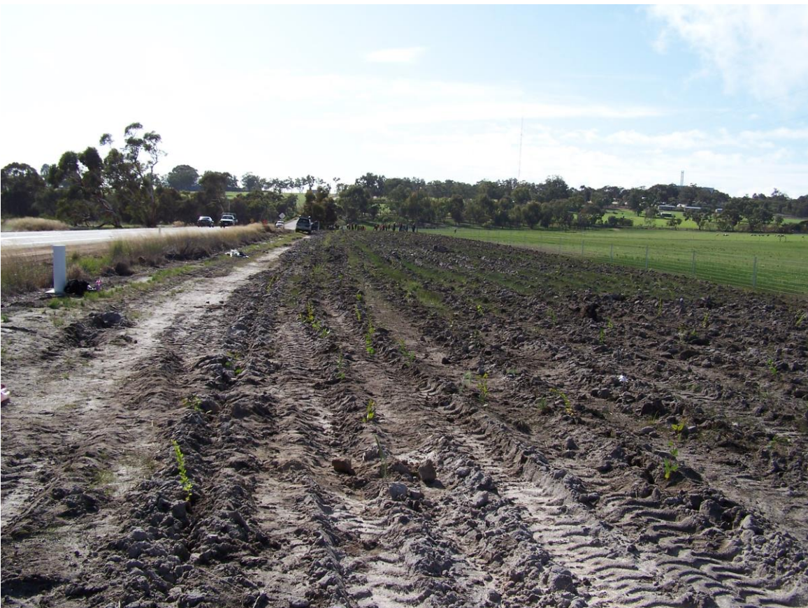
July 2011 – Planting