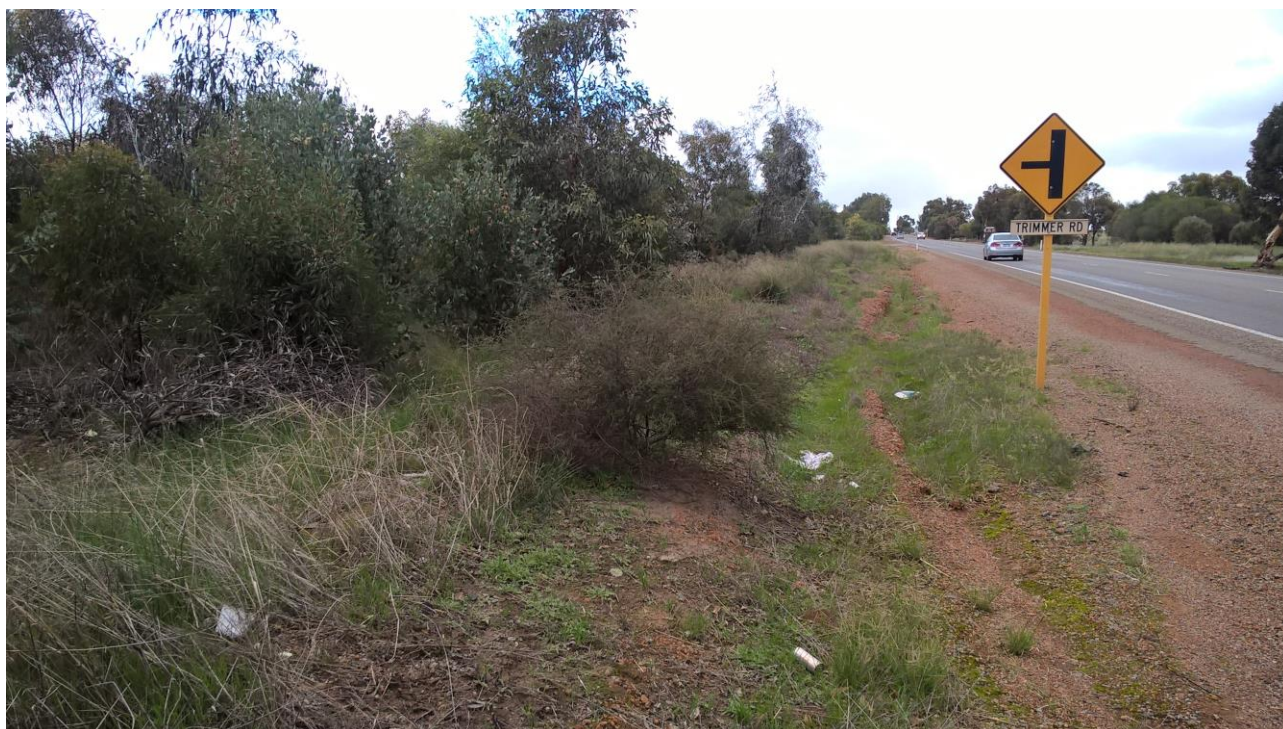
April 2016 – Monitoring