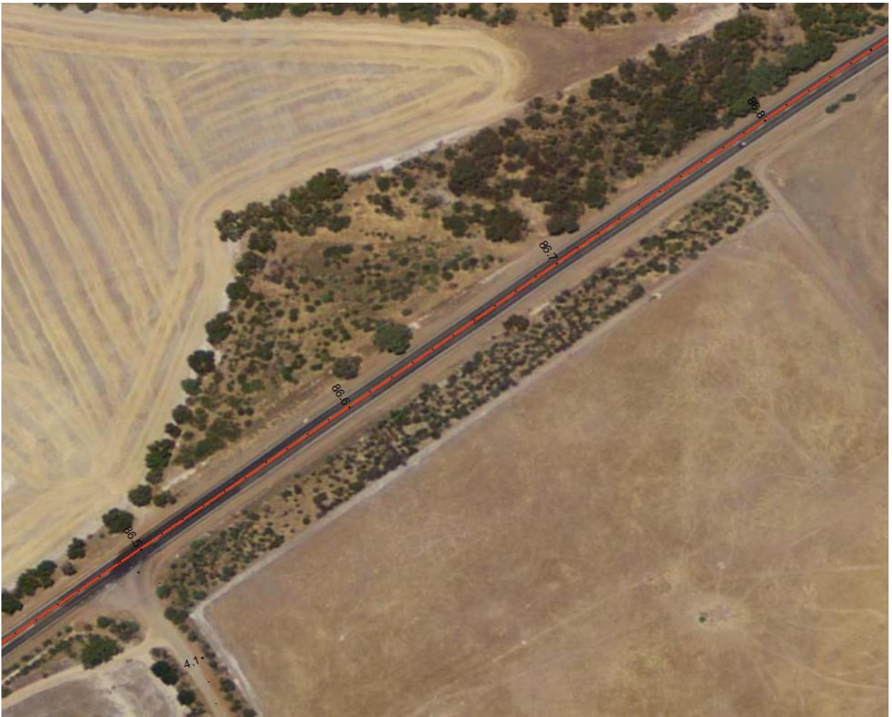
Figure 1: Great Eastern Highway Revegetation SLK 86.49 and 86.8