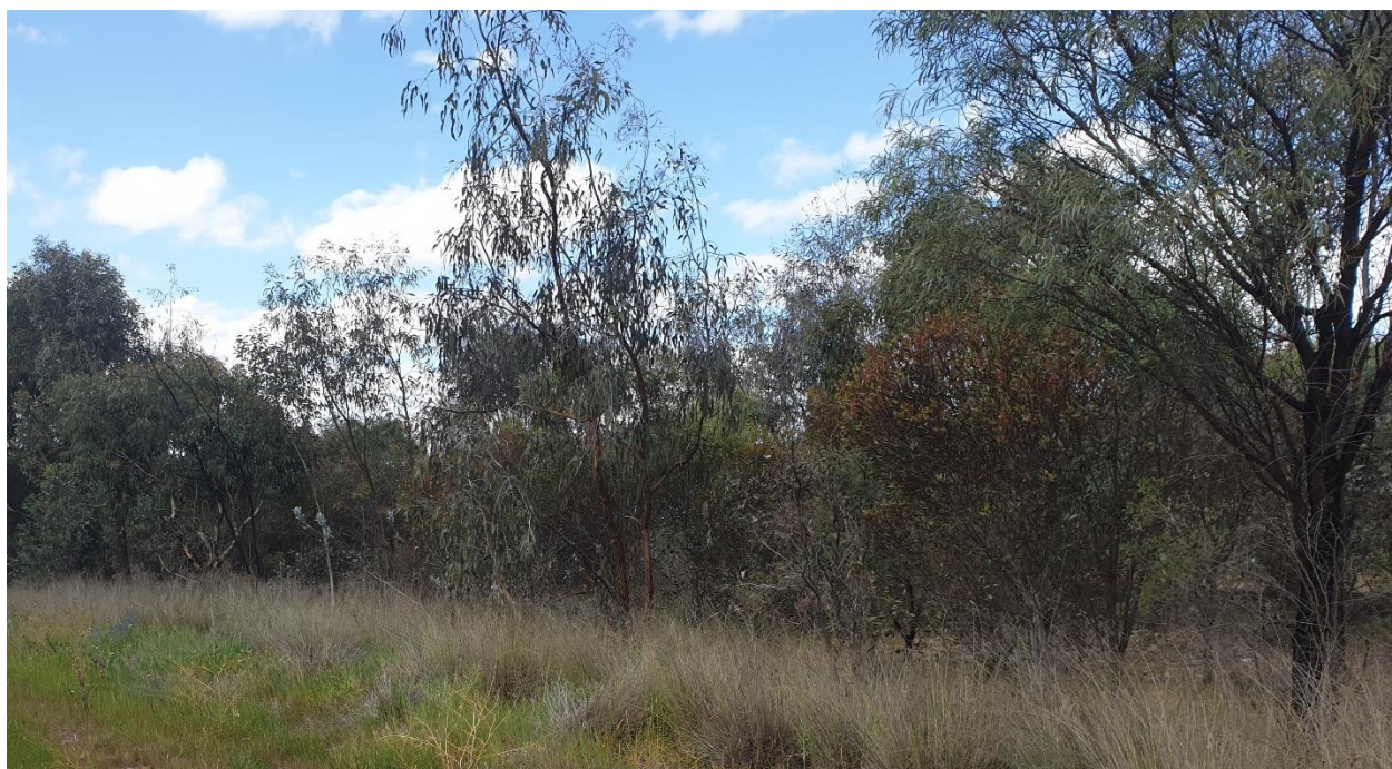
September 2020 – Monitoring