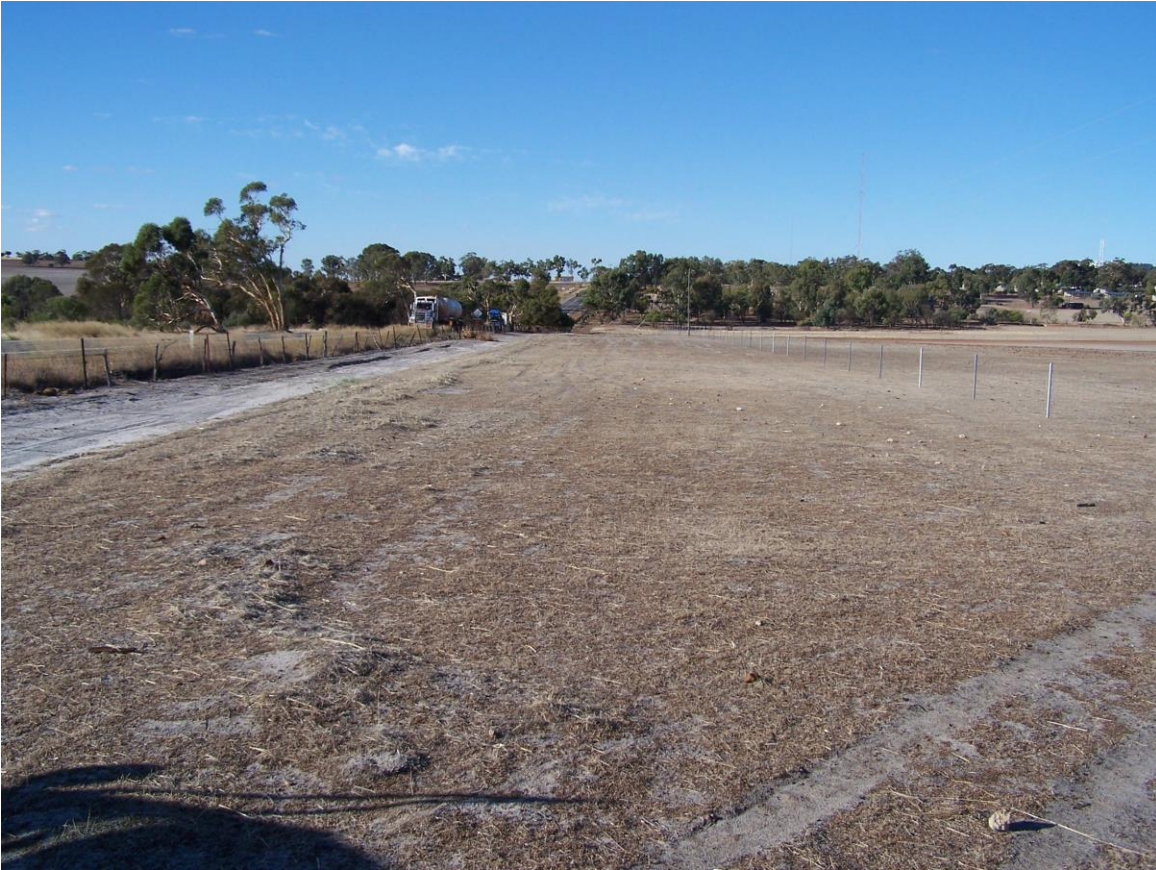
May 2011 – Initial Photo