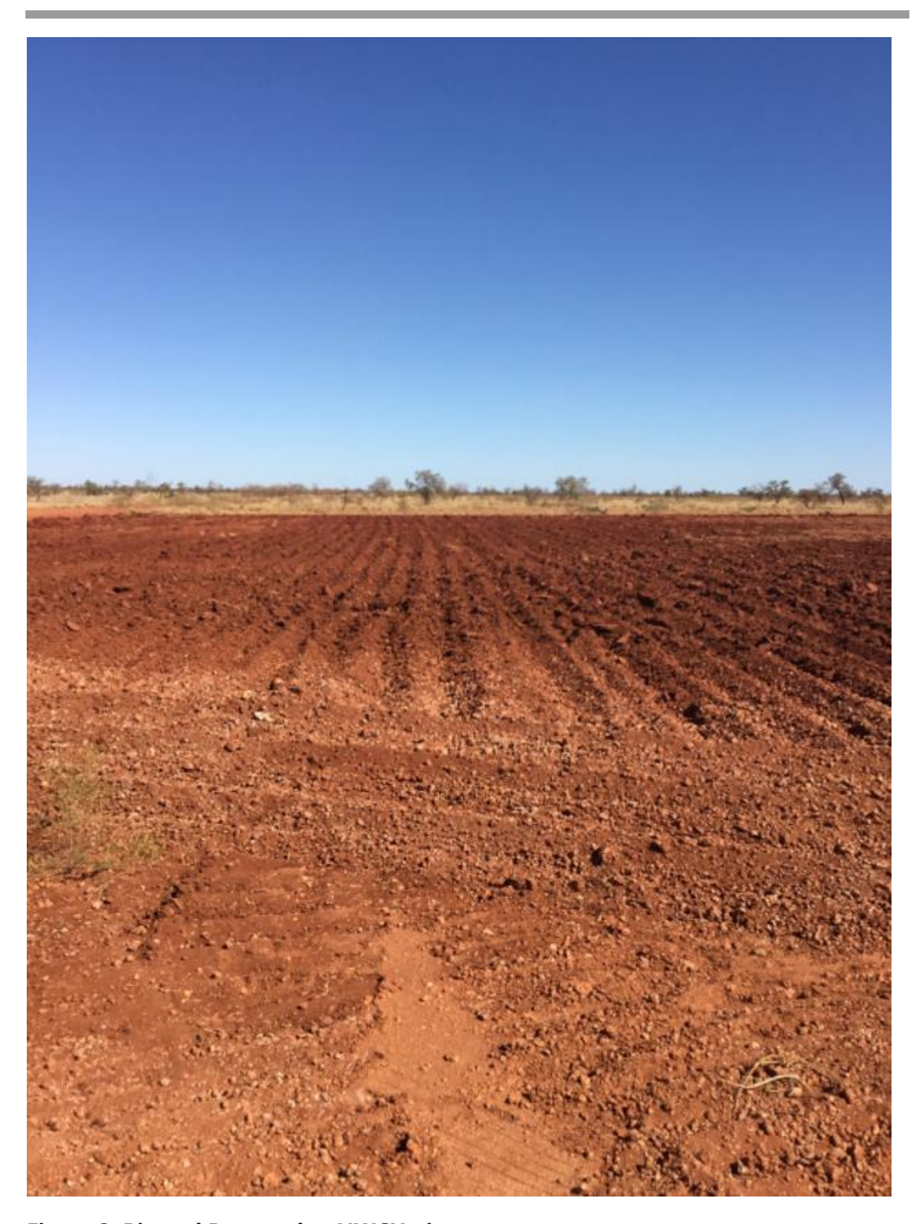
Figure 2: Rip and Respread at NWCH pit