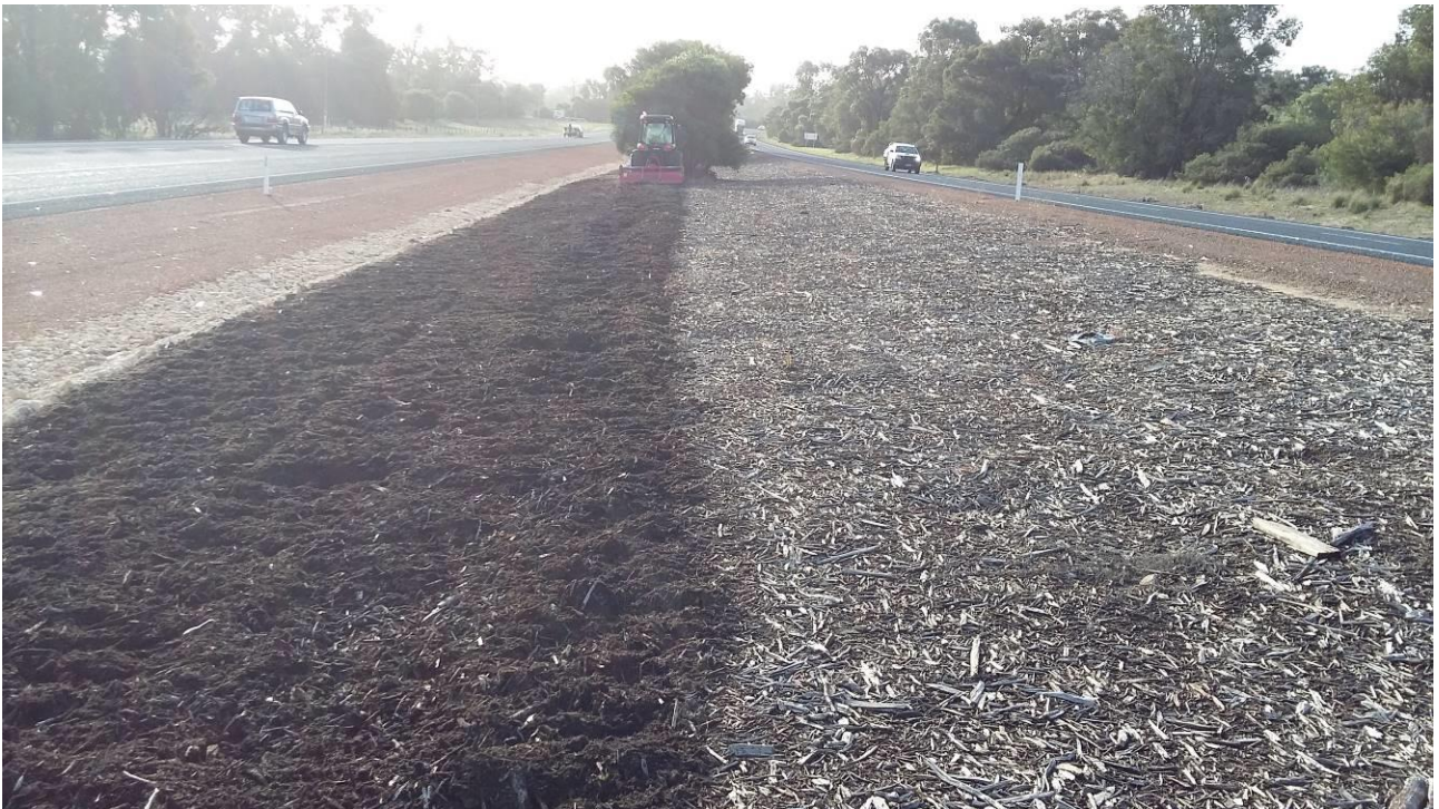
Figure 2. Rotary hoe used to blend mulch and subsoil prior to direct seeding