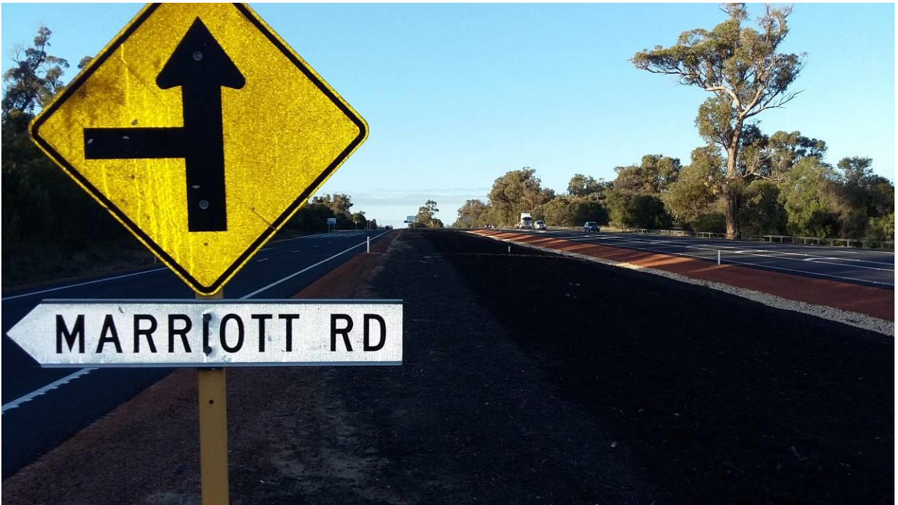
Figure 1. North bound Median