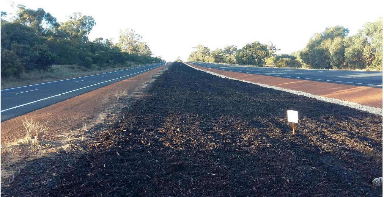
Figure 3. Direct seeding and application of a liquid soil amendment 2016