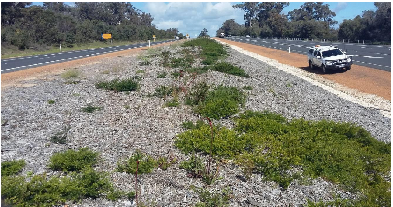
Figure 4. Germination in 2017