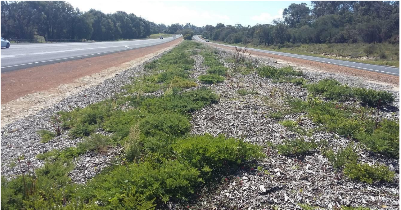
Figure 5. Median vegetation in 2017