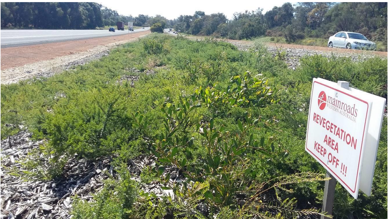
Figure 6. Median remains relatively free of weed species 2 years post planting