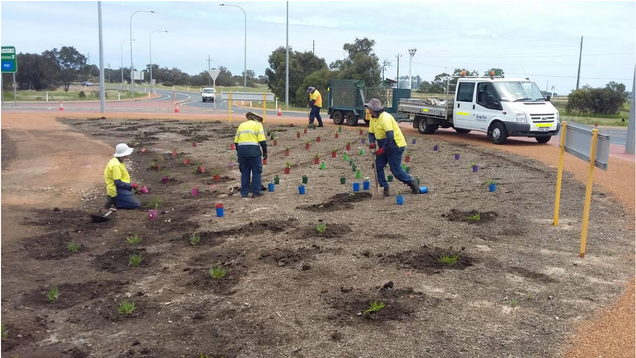
Figure 5. Activ Foundation planting seedlings Winter 2017