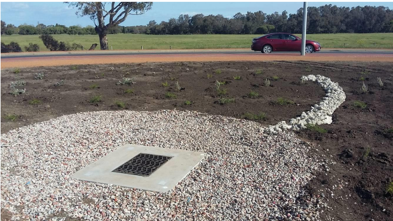
Figure 4. Sump installed with slotted drainage and rock pitching