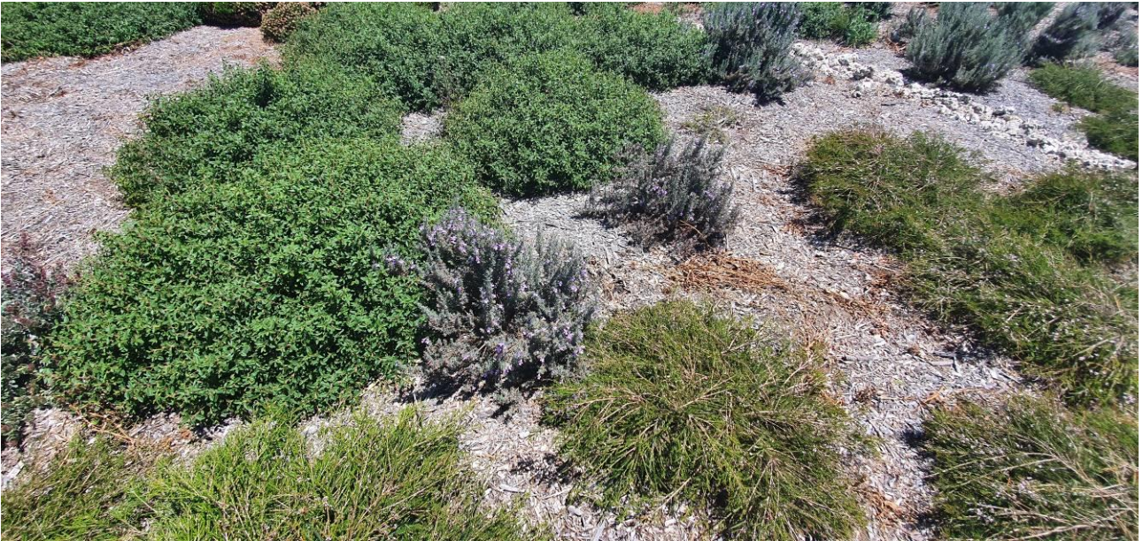
Figure 7. Plants growth 2020.