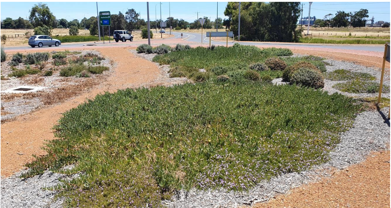
Figure 6. Completed Landscaping 2020