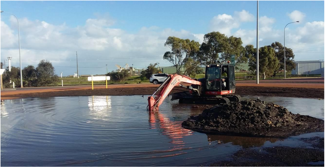
Figure 3. Excavator used to install a soakwell in the low point of the roundabout