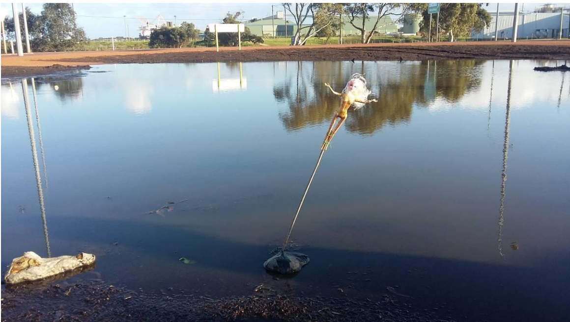
Figure 2. Winter 2017 – Significant rainfall and poor draining soils resulted in the centre island becoming waterlogged.