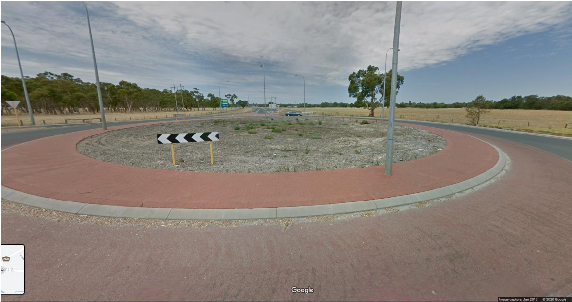
Figure 1. Post construction 2017