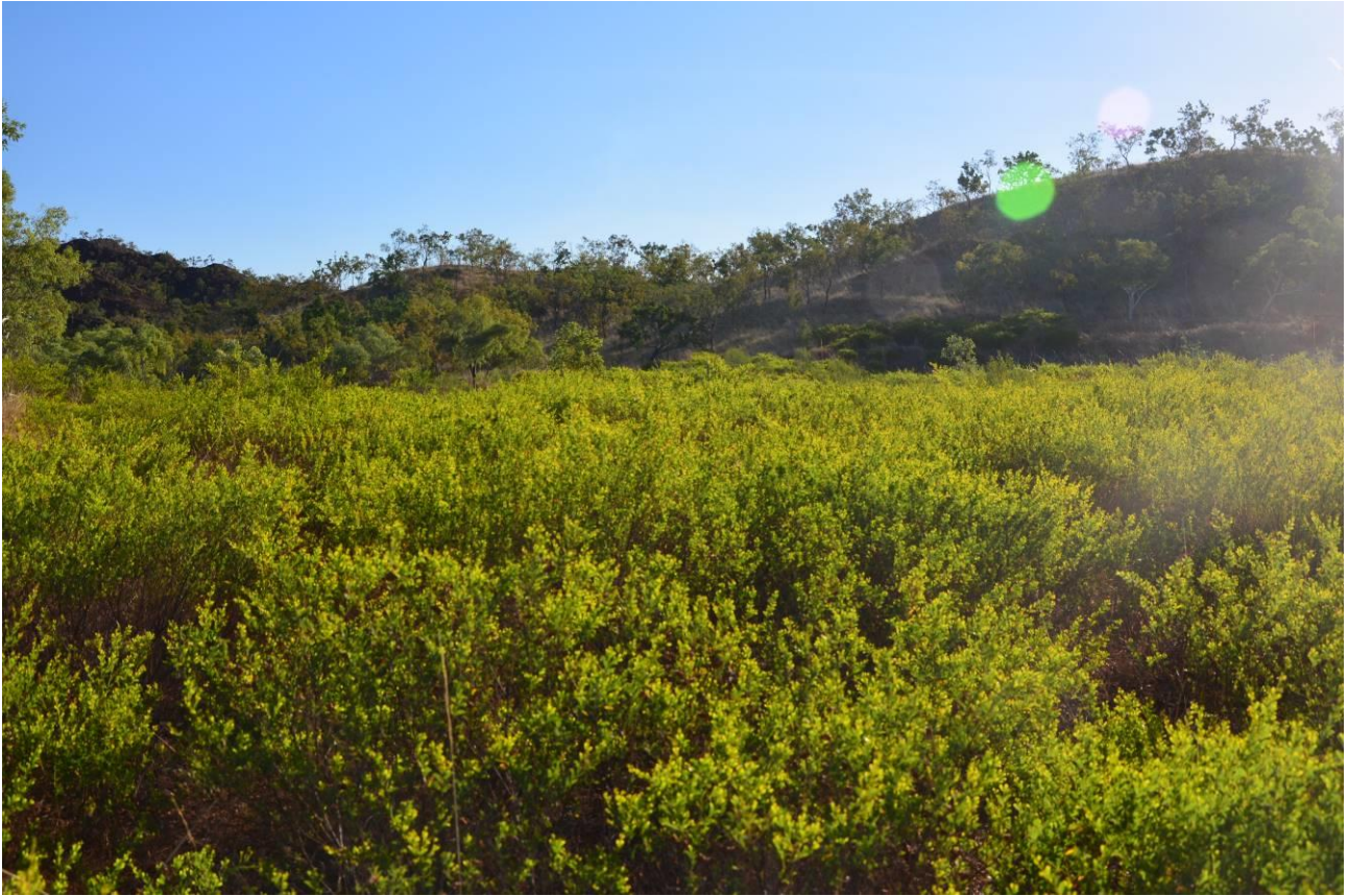
Figure 3: Revegetation Site 2017