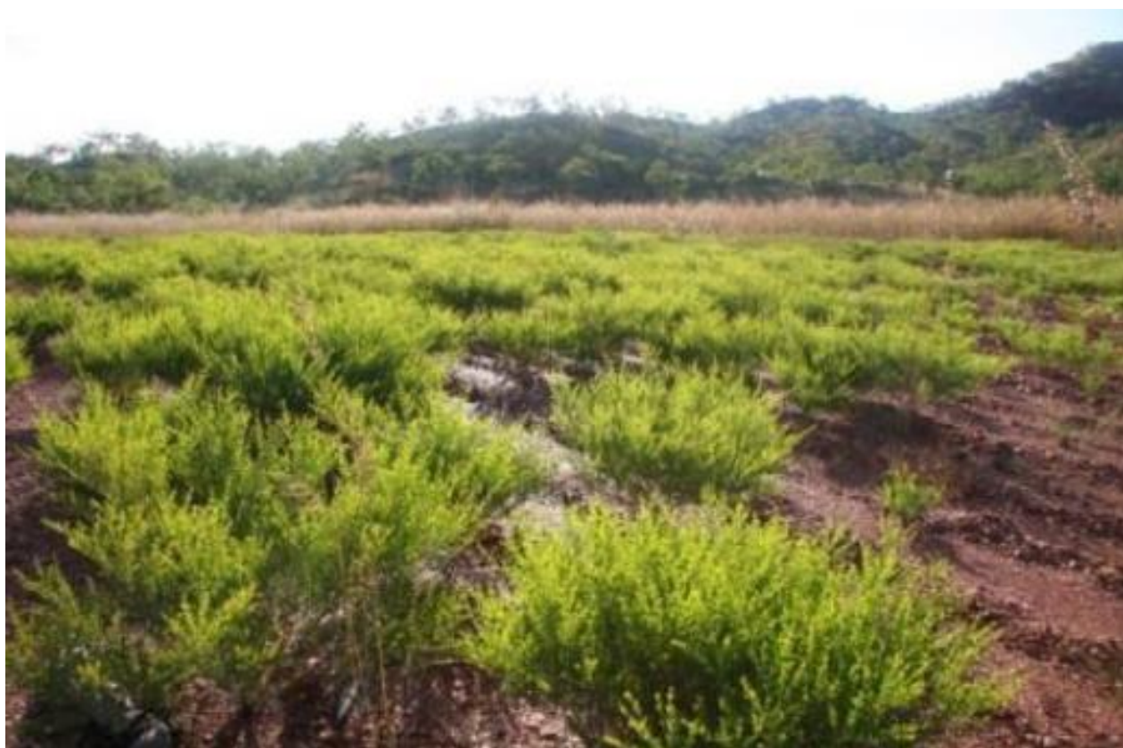
Figure 2: Revegetation Site 2016