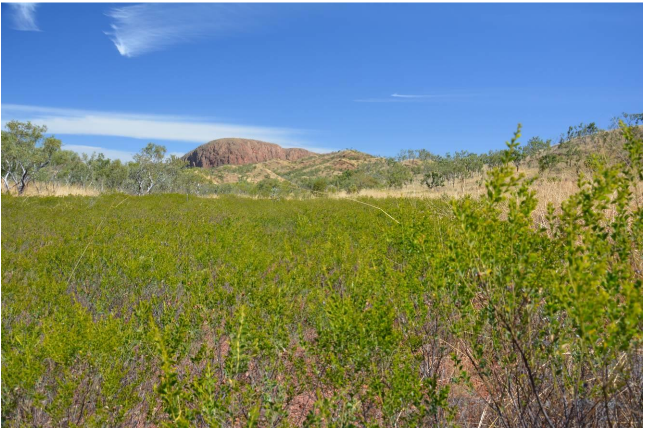
Figure 4: Revegetation Site 2018