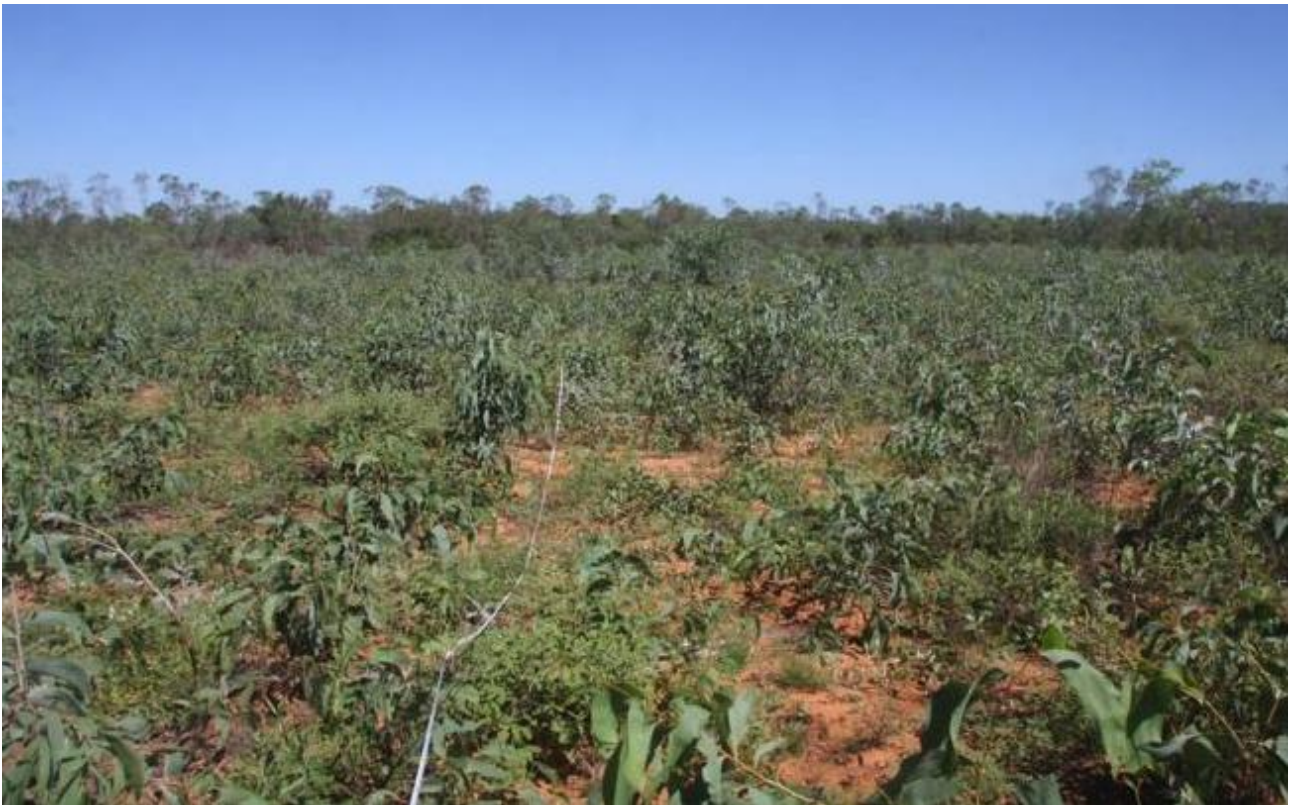
Figure 2: Revegetation Site 2016