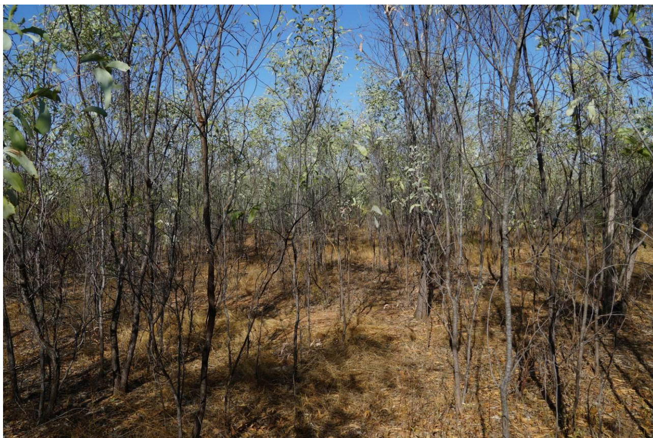
Figure 4: Revegetation Site 2020