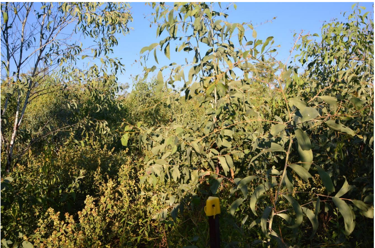
Figure 3: Revegetation Site 2017