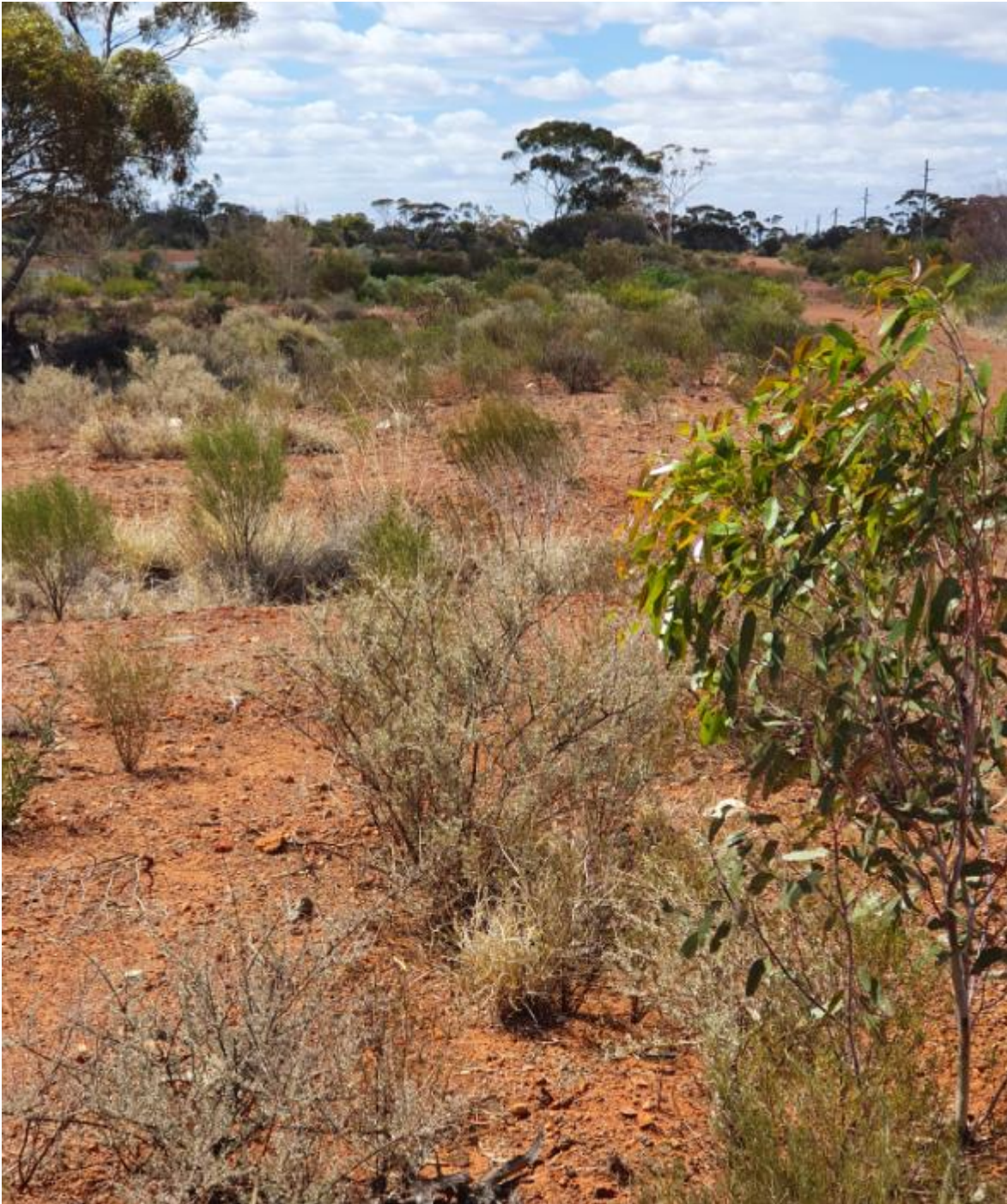
February 2018 – Monitoring