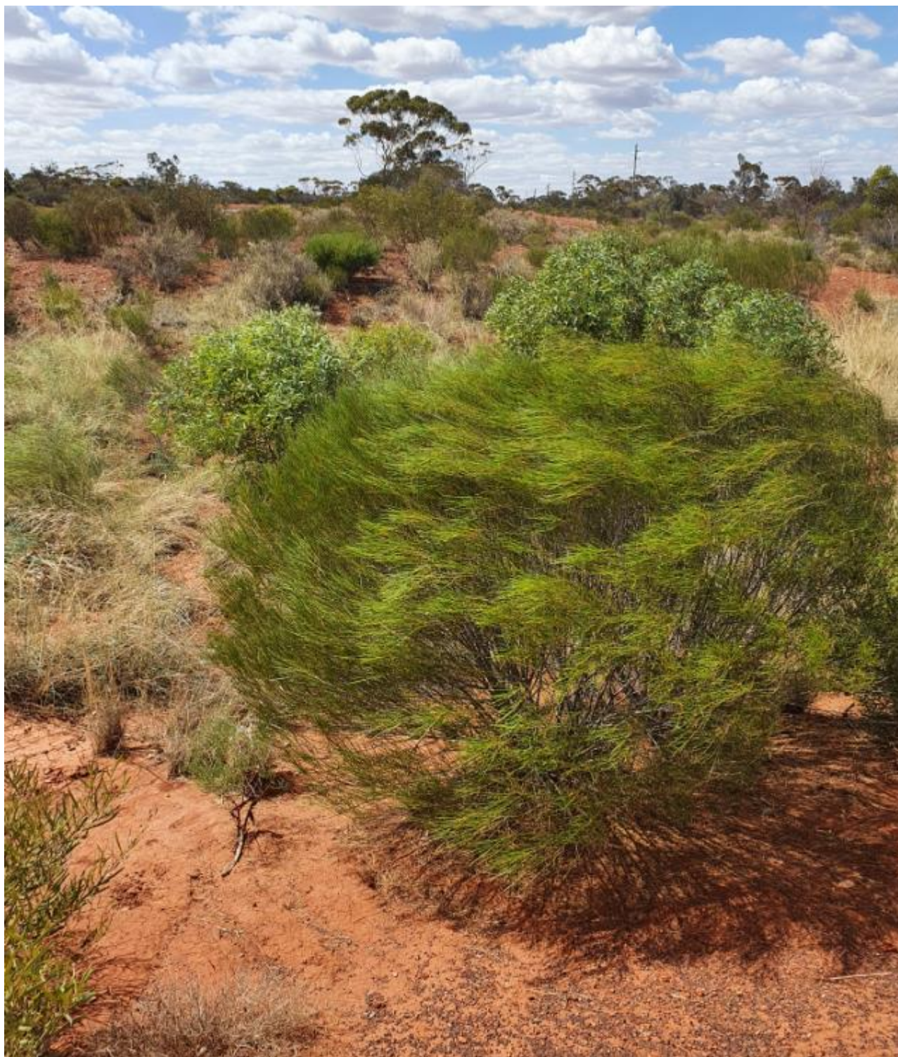
2013 – Vegetation prior to clearing