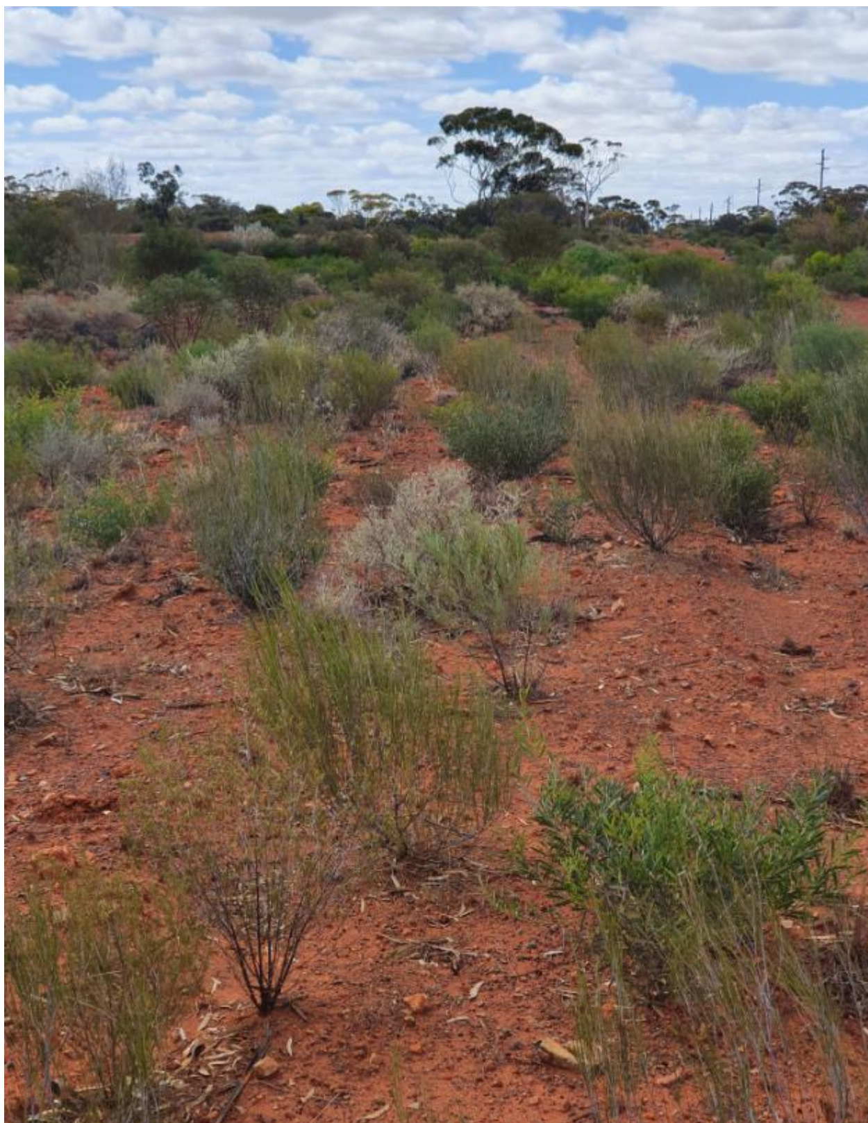
December 2020 – Monitoring