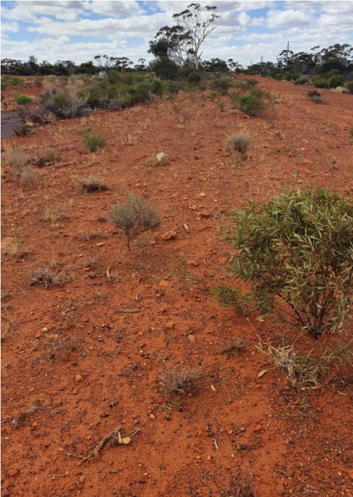
March 2015 – rehabilitation monitoring