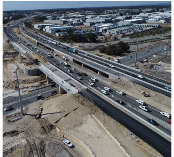
Guildford Road bridges

From 9pm Friday, 9 December to 5am Monday, 12 December the Moojebing rail crossing will be closed so we can remove the existing bridge screens on the old Railway Parade bridge and install drainage along the rail. To safely complete these works over the train line, the Midland Line will also be closed. Train replacement bus services will operate while train services are cancelled. For more details, including the closure times and operation of train replacement services, visit transperth.wa.gov.au .