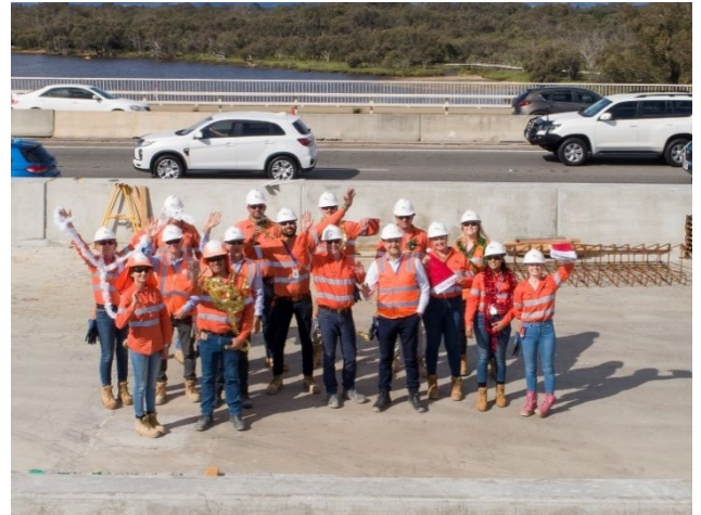
Happy holidays from the Tonkin Gap Project

We understand December is a special time for many which is why we will be pausing construction from 1pm 23 December to 7am 9 January for a holiday break. During the break the Main Roads Customer Information Centre will still be available for urgent enquiries – 138 138.