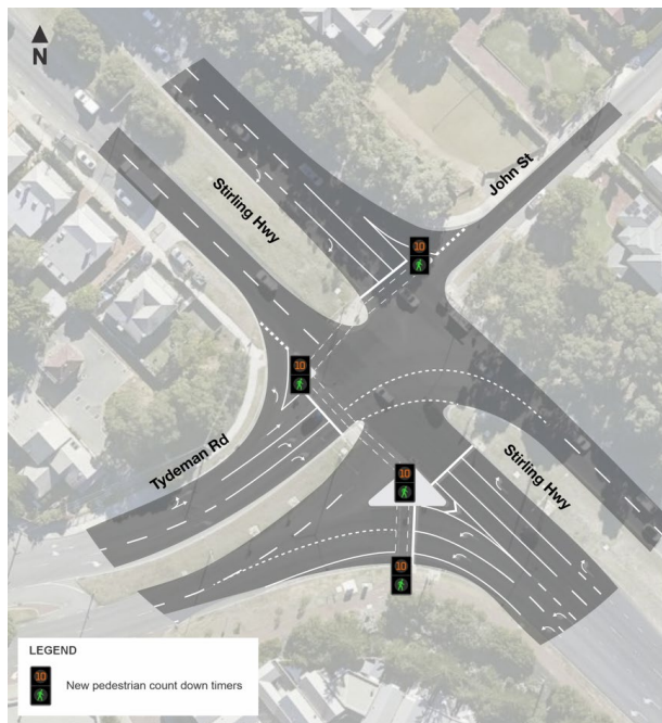
Figure 2: Upgraded pedestrian crossing at Tydeman Road and Stirling Highway.

In the Christmas holidays, new timers will be installed (diagram below).