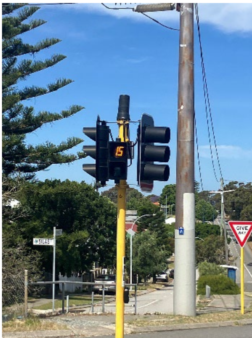
Figure 1: Pedestrian Countdown Timers at Marmion Street and Stirling Highway.

New timers at all four corners, benefiting locals and school children attending East Fremantle Primary and John Curtin College of the Arts.