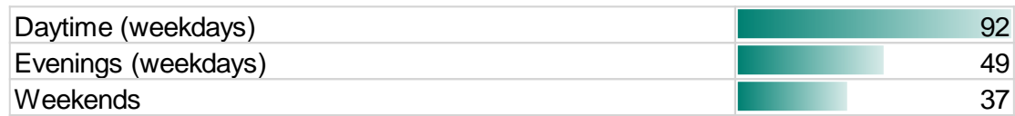
Table 6: Participants preferred time for future engagement.

Participants were asked when they would like to be contacted by the project team. The majority selected daytime on weekdays.