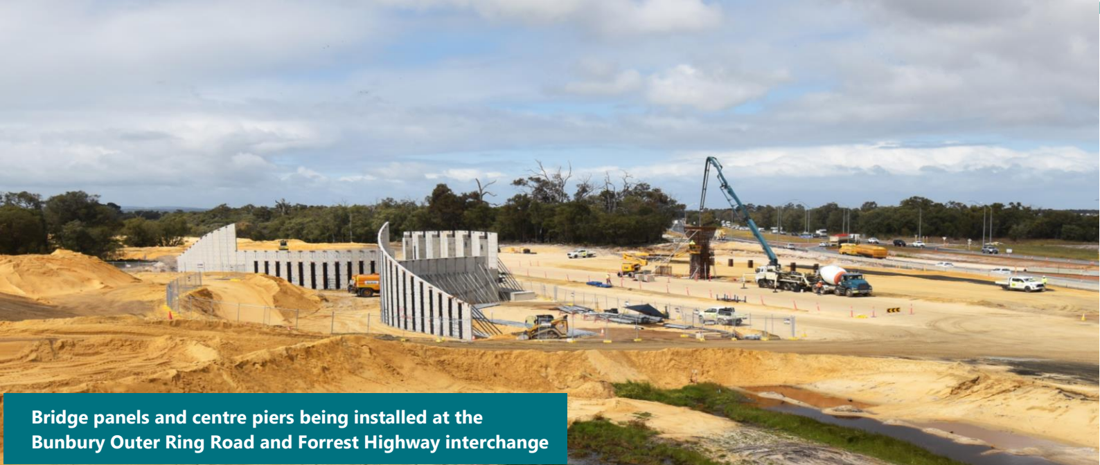
Bridge panels and centre piers being installed at the Bunbury Outer Ring Road and Forrest Highway interchange

This update contains information regarding the current and future works happening on the Bunbury Outer Ring Road (BORR) project. Information in this update is current as of October 2022 and is subject to change. For the most recent updates visit the Main Roads BORR website or visit the Bunbury Outer Ring Road Community Facebook Group.