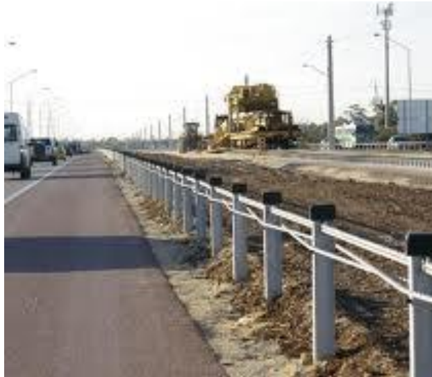
Photograph of installed Brifen TL3 4 Wire Rope Barrier