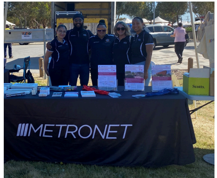
The New Midland Station team meeting community members at City of Swan event

The team spoke to over 260 people throughout the day, providing information on the project and works happening through the area. The New Midland Station project will replace the existing station with a new station closer to the heart of Midland.