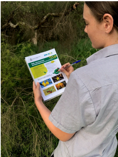
A student using the Your Move Kambarang season worksheet on the walk home from school

Schools will also be able to access the newly released children's book Djinang Bonar: Seeing Seasons on the Your Move reward shop to help further explore this topic in classrooms.