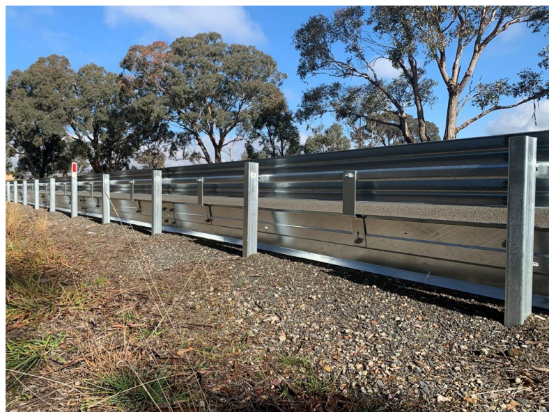
Photographs of the Biker-Shield System