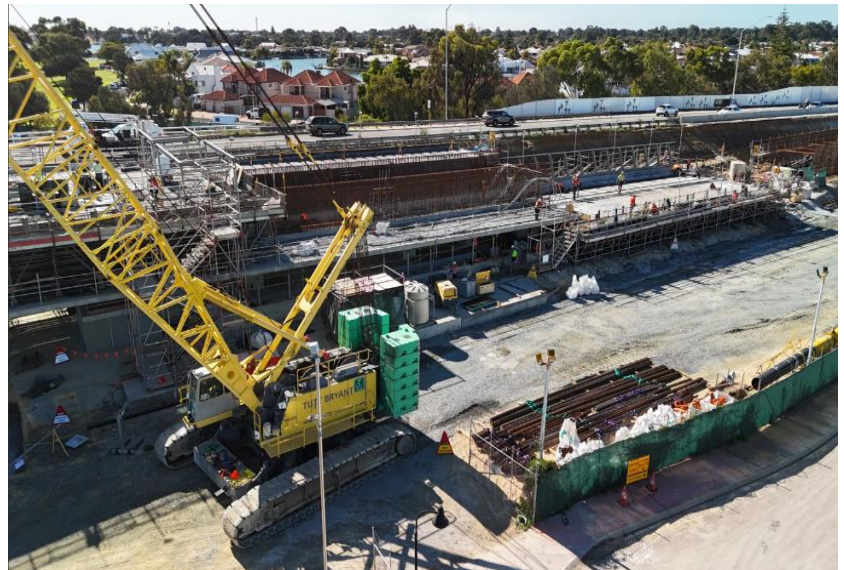
Image: Casting yard on Waterlily Drive

Following this, construction of precast concrete retaining and noise walls will get underway in that area.