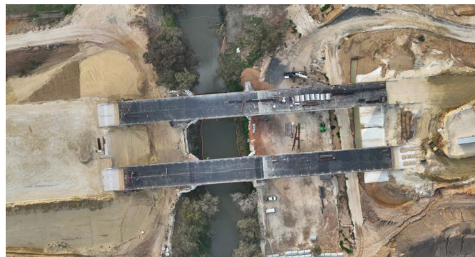
Collier River twin bridge

The twin bridges at Collier River now have poured concrete decks, precast safety barriers installed, and bearings grouted across both spans.