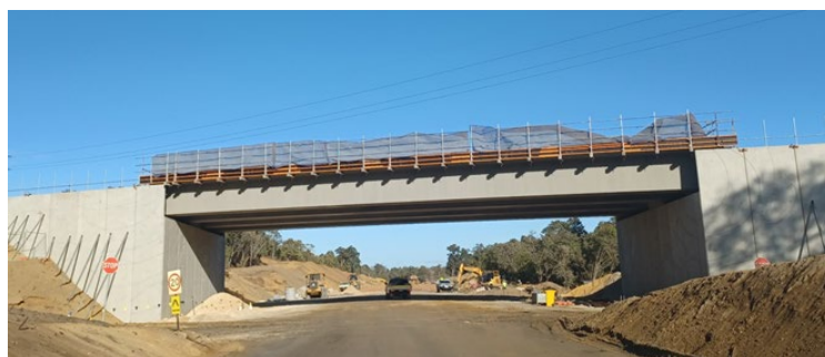
Yalinda Drive overpass

Over at the Yalinda Drive overpass, the fauna wall on the outside of the approach slab has been completed.