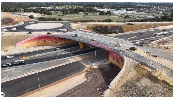
Paris-Clifton Road interchange

At the Paris-Clifton Road interchange, the installation of approach parapets, also known as, safety barriers, have been installed. Additionally, the fauna fencing installation has commenced.