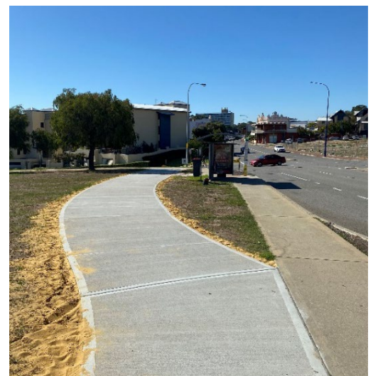
Figure 1: New shared path on Canning Highway (behind bus stop).

To sign up for Project Updates, click here . For enquiries, please phone 138 138 or email enquiries@mainroads.wa.gov.au .