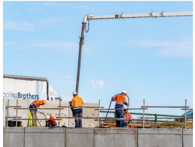
Concrete pour at Guildford Road

Intermittent lane closures will be required on Railway Parade and Guildford Road, while we finish building the bridge deck and remove the temporary bridge protection. This work will be completed at night. To keep up-to-date on all upcoming roadworks, visit https://www.mainroads.wa.gov.au/tonkin-gap/#roadworks