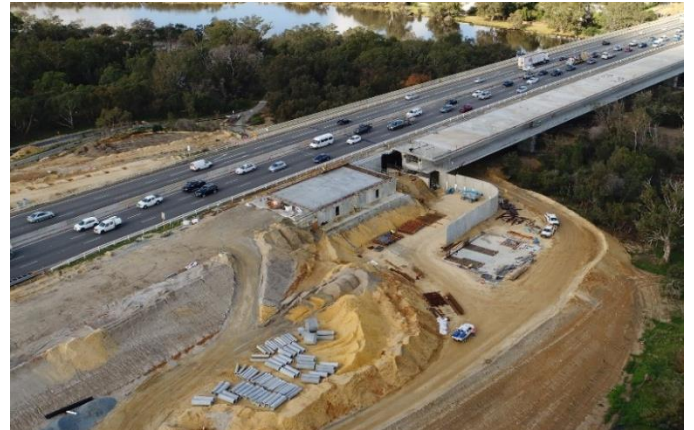
Redcliffe bridge northern approach

This month, works will continue to build the bridge abutments and the road approaches at the northern and southern ends of Redcliffe bridge. The team will start to install traffic barriers and noise walls on the bridge deck from mid-July to early August.