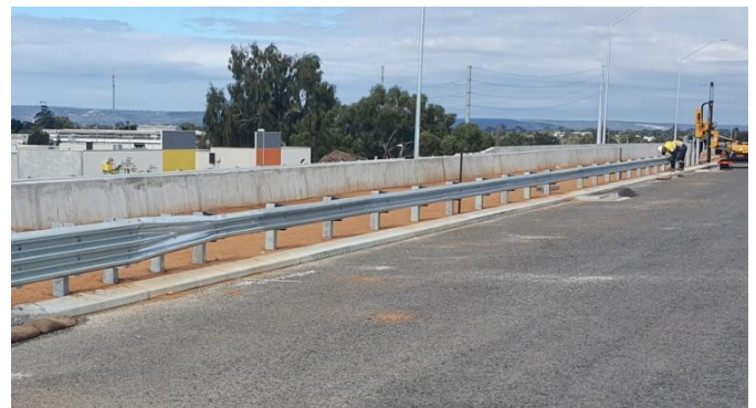
Steel traffic barriers installed along the project

During July, we will be working at night to install permanent steel traffic barriers between Railway Parade and Dunstone Road. A piling and drill rig will be required to install steel posts into the ground to support the barriers. During this work, there will be noise and vibrations.