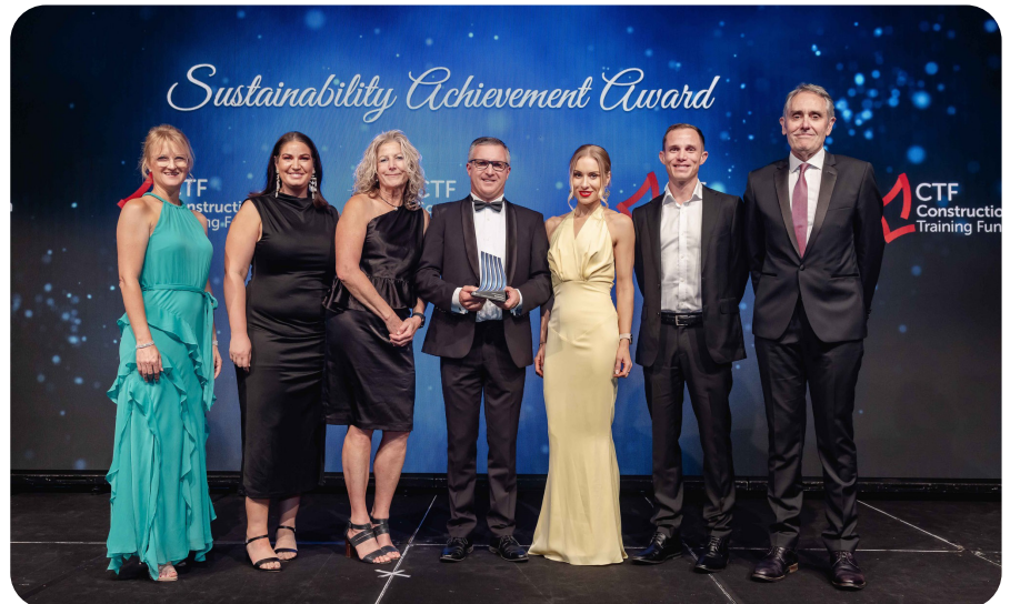
Tonkin Gap team receiving the Sustainability Achievement Award

"The team has implemented four Australian firsts in the construction phase with each making a valuable contribution to the project such as reducing the amount of waste," he said.