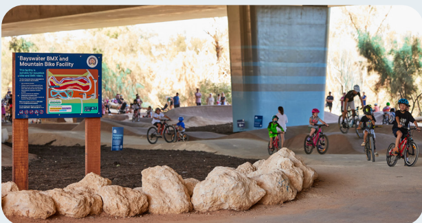
BMX track & mountain bike skills facility opened under Mooro-Beeloo bridge

On the southern side of the river, we have established an interpretation node near the bridge which forms part of the Department of Biodiversity and Attractions River Journeys' program. For this node, we conducted heritage surveys, and two sites of Aboriginal cultural significance were identified within the works area which now form part of the signage.