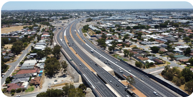
Tonkin Highway speed limit reinstated to 100 km/h

The wait is over for our stakeholders, commuters and communities in and around the Tonkin Gap Project. And while there will be a little more disruption to go, as the METRONET Morley-Ellenbrook Line is being completed, motorists are now experiencing a much quicker and smoother journey.