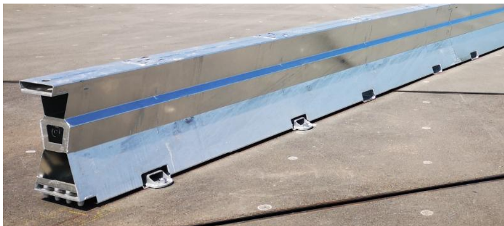
Photograph of Installation (2# anchor shoes shown)