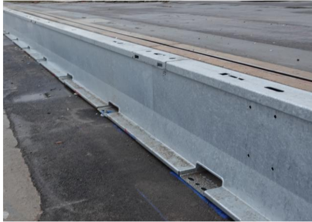
Photograph of Installation