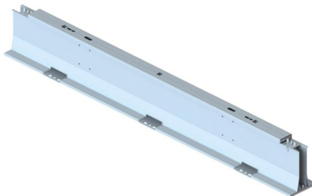
Isometric View of 6 m long unit