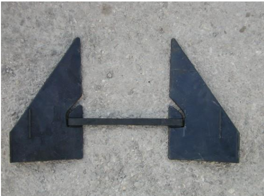
Photographs of joint wedges