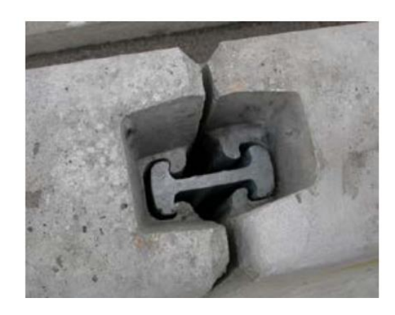
Section and Joint Photographs