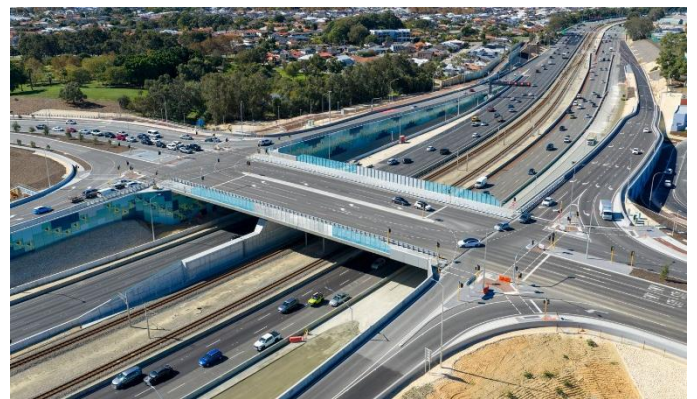
Stephenson Avenue Interchange open to road users.

The temporary closure of the Cedric Street northbound on-ramp will remain in place until mid-2026 to safely undertake ramp widening and intersection upgrade works.