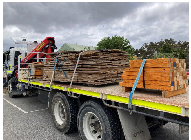
Figure 6: Construction timber for donation.

A wonderful highlight was experienced by the Men's Shed in Albany, four hours south-west of Perth, when the project's Environmental Manager personally delivered a ute-load of timber in his own time. The group had been using the materials to build shelters for the local little penguin population (see photo right).