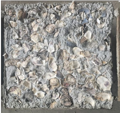
Figure 4: Recycled oyster shell surface.

mats support native marine life, enable blue-carbon sequestration and reduce visual and hydrological impact.