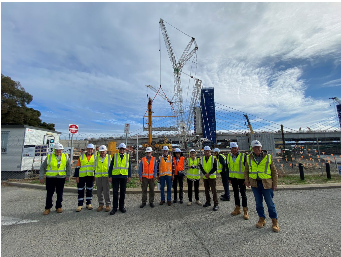
Figure 8: Retired Engineers from Engineers Australia visiting the project.

We thank them for visiting and sharing their amazing construction stories from their own careers and offering engineering insights.