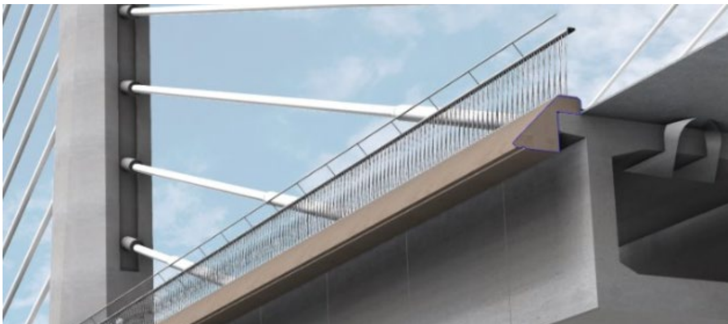
Figure 3: Bridge parapet.

parapets feature an exposed aggregate finish and will be lifted into place over the next few months. They will extend along the full bridge alignment, including the edge beam segments and abutments.