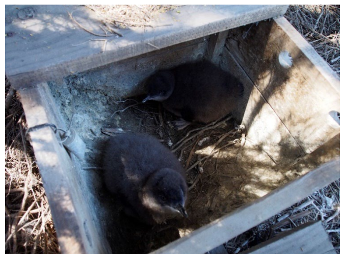
Figure 7: Construction timber used to build shelters for the penguin population.