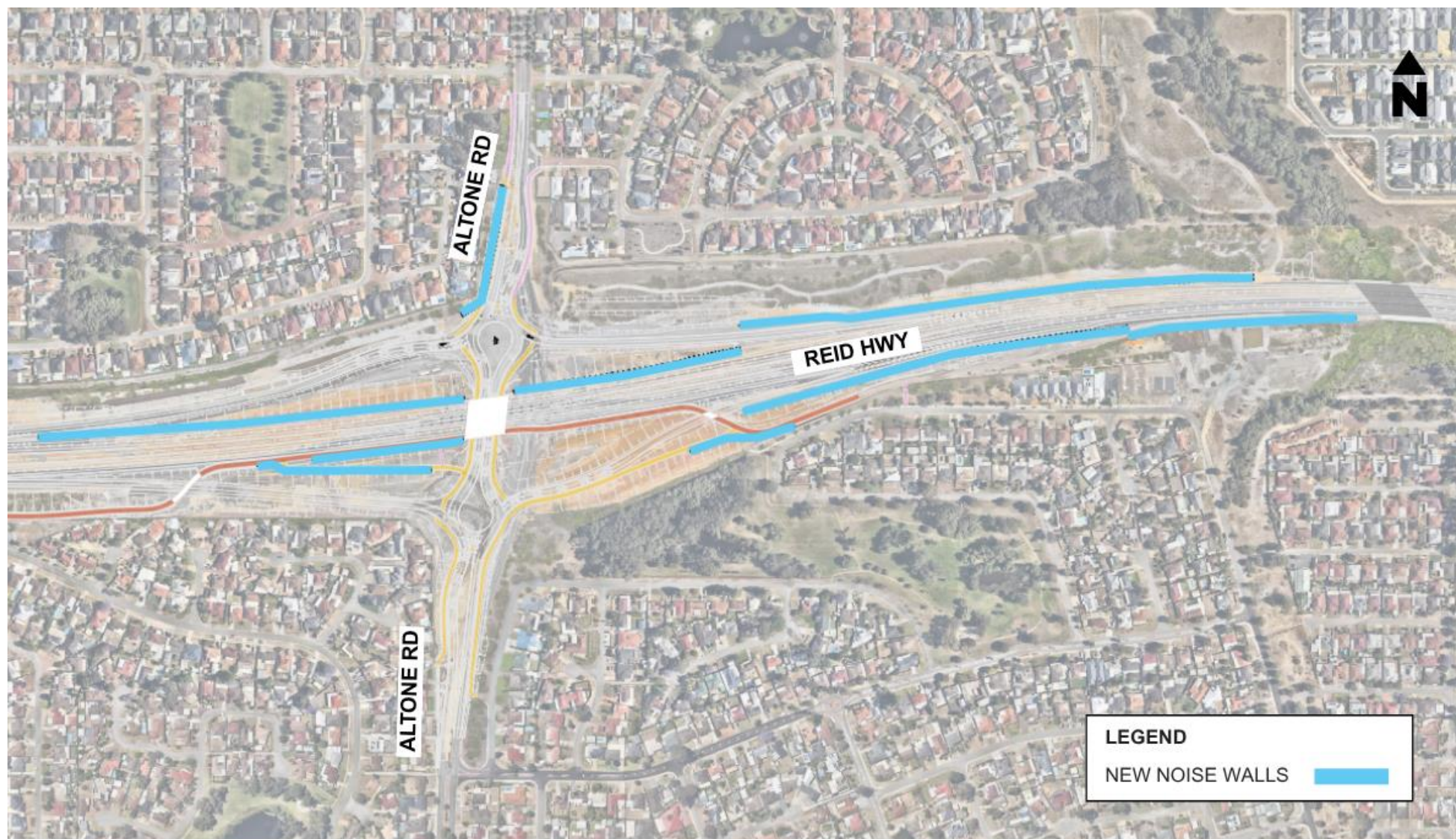
Map – Noise wall alignments (Reid Highway & Altone Road)