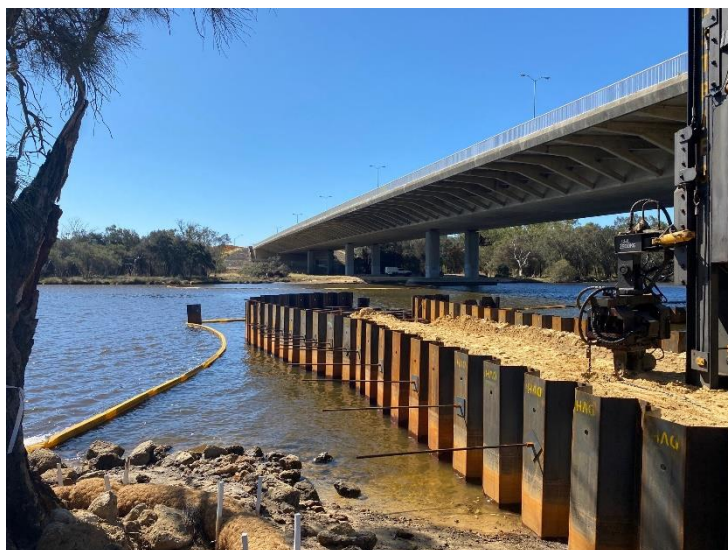
Temporary cofferdam construction

Once we have finished the construction of the southern cofferdam (working platform) in the Swan River, we will make a temporary footpath on the south side of the river, to run under Redcliffe bridge to maintain access (map 1).