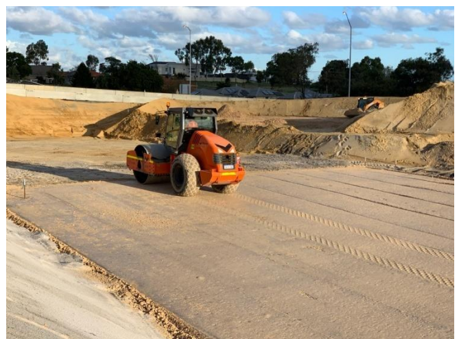
Roller compacting a crane pad for the Guildford Road underpass